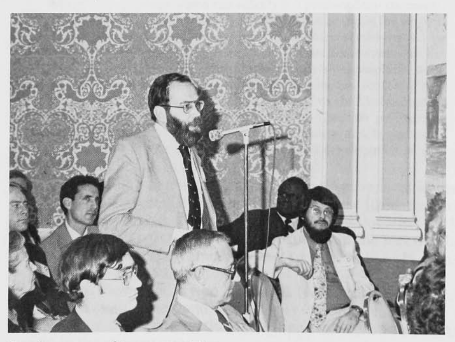
Speakers respond to a presentation.