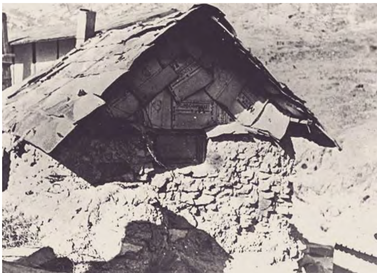
Sun Myung Moon built, lived and taught in this shack, built with rocks, dirt and cardboard boxes in 1951-52

Thus, people tried to pull the pile from both ends. But the more they pulled, the tighter the tangles became until the pile was but a lump, like a noose of sin. It began rolling here and there, depending on who was pulling it.