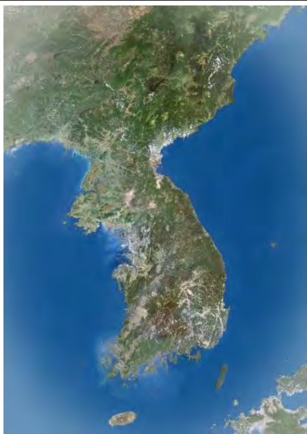
A satellite view of the Korean peninsula

The epoch-making measure that Jesus takes to fulfill this purpose is the Last Judgment in the Last Days.[8] With this judgment, Jesus will sever that fixed point, which is at the last portion of the tangled skein of history. Once he does, then at the time of the Second Advent he should be able to find the path of the Principle and freely develop God's Will in the world.