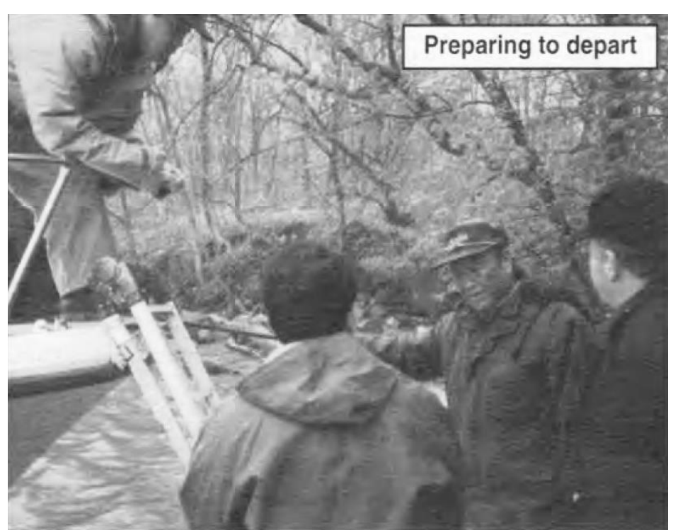
May 4, 1996, departing the Unification Theological Seminary, Barrytown, NY by boat

Everything is open with true love; unevenness is overcome and there is no shadow in front of love. Nothing but only true love can gain perfect freedom!