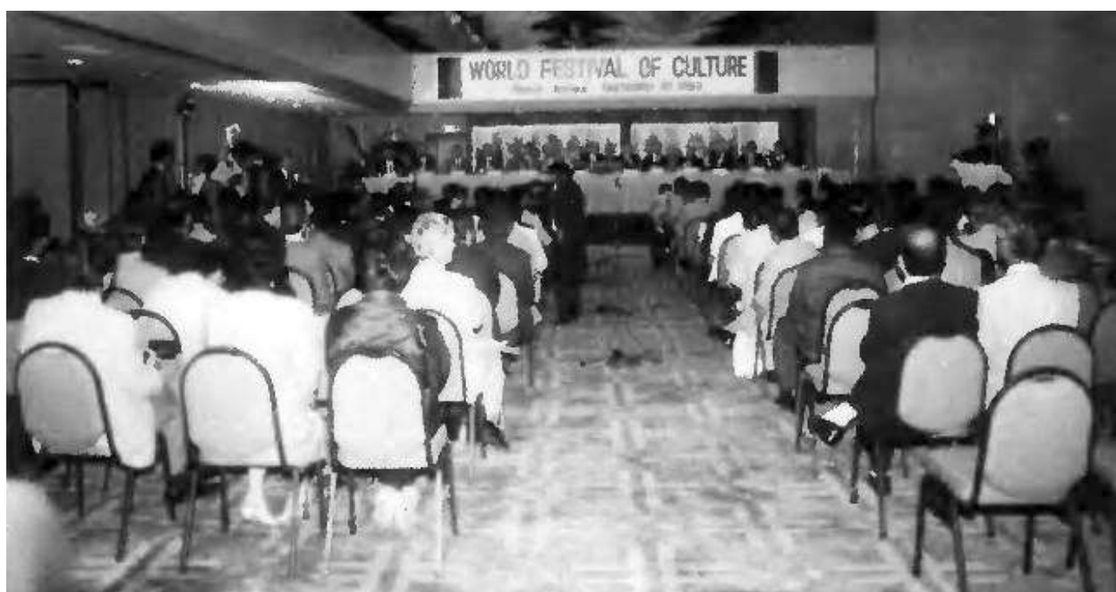
The press conference announcing the World Festival of Culture

In the spirit of his prayer of September 27, Father spoke of the fulfillment of God's restoration work in history. God's tireless effort in history has been to restore the lost position of elder brother in Adam's family. It was to be on this foundation that the right order of God would be established on the family, national, and worldwide levels. At this time, True Parents' offering, especially over these past 43 years, could be totally accepted by God. Thus the year of 1988 begins a new era in human history.