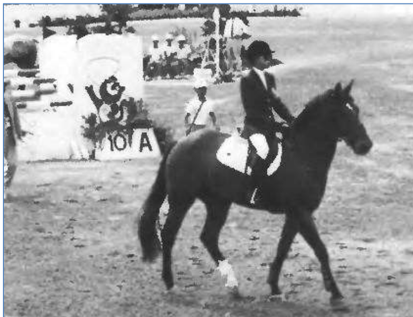
Un Jin Nim riding for the joy of God and the sake of True Parents

In all, more than 2,000 guests came to the special presentations. Without exception, these guests were moved by the staggering beauty of the performances and could feel something of the giving heart of God and True Parents through this gesture.