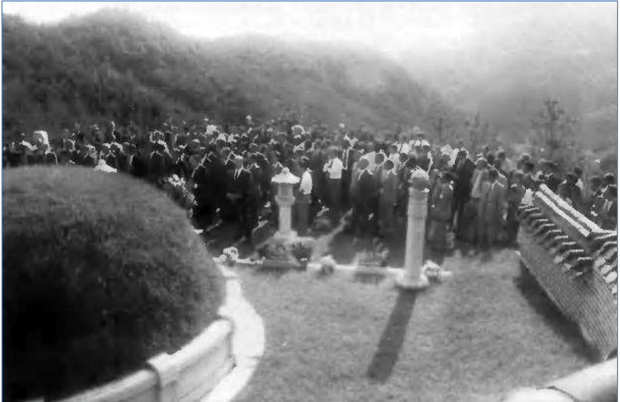
"The real lovers and leaders of their nations."