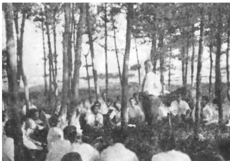
Master speaks to Japanese Unification Church leaders at Cheju Island during their tour across Korea country in September 1972

Because of the fall of man, we received the Satanic blood. If the parents, Adam and Eve, did not fall, then they would have been sinless children and children of God. Because of the fall of man, both became children of Satan. Originally, lordship is only from God. God is the only Lord over man. However, because of the illicit relationship with Satan, Satan became the illegal lord over man. The Principle says that love is accompanied by the power of control, or domination. Therefore, even though it was an illicit love, Satan has a certain power, or authority, or right to claim ownership over man. But, according to the principle of creation, God is original Lord. Therefore, both can claim man. However, it is physically impossible to cut Adam into two pieces and Eve into two pieces, and then divide between God and Satan. Therefore, from the standpoint of the Principle, God established certain rules to divide man into two parts. From the position of God as internal being, and others in an external / internal / external relationship and subject and object relationship, God has set the rules to divide. Therefore, God divided the fallen Adam and Eve through their two children.