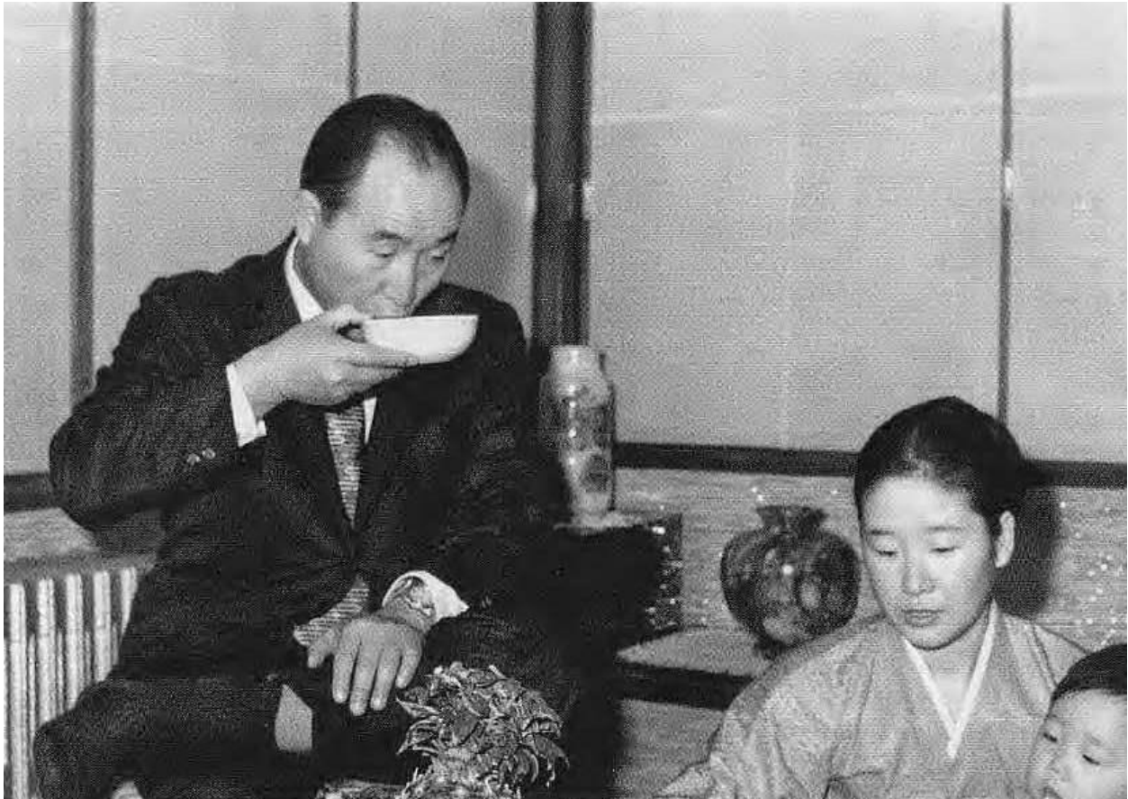
True Father with his ideal partner in 1967, the year he gave this speech