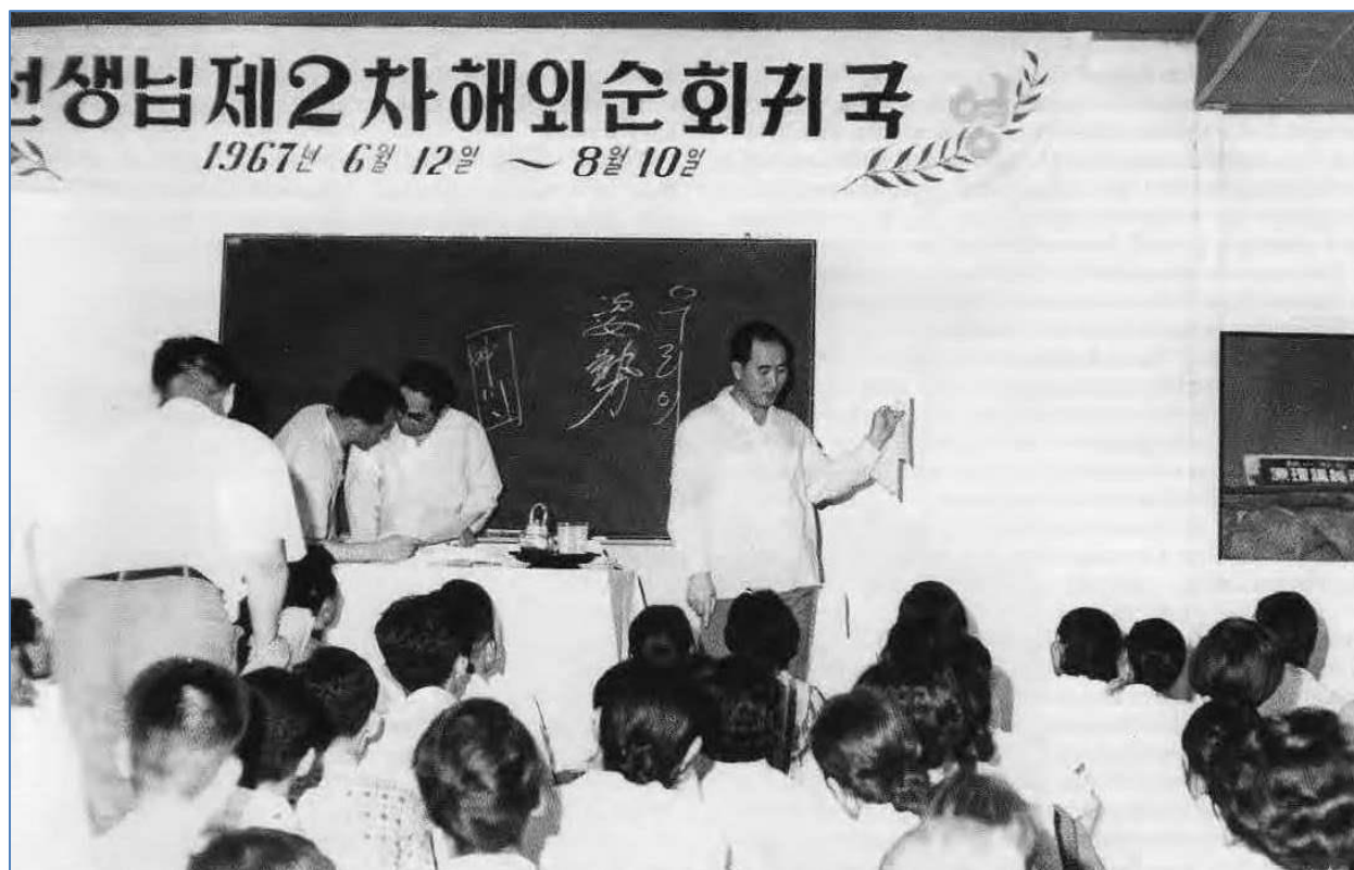
August 10, 1967, at the welcome home celebration after True Parents returned from the second world tour

Internally, he probably called this man dozens of millions of times. How strong was his desire to love this man? Imagine how much God has longed to live with this one man and share love with this person.