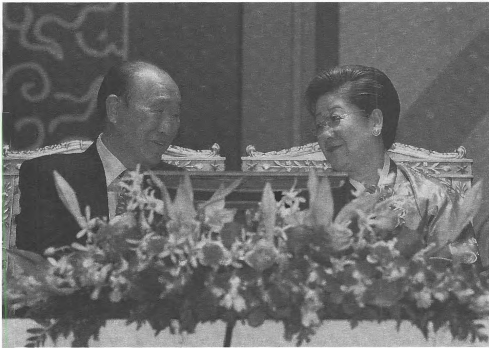
The Reverend Dr. Sun Myung Moon and Dr. Hak Ja Han Moon