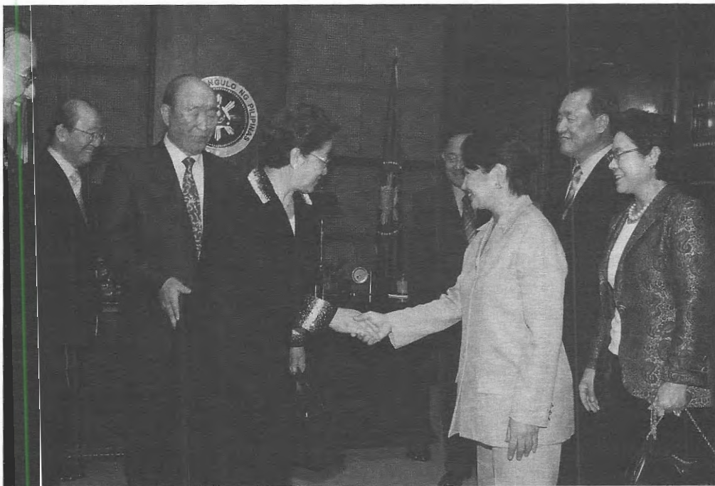
President Gloria Macapagal Arroyo of the Philippines welcomes the Reverend Dr. Sun Myung Moon and Dr. Hak Ja Han Moon to the presidential palace in Manila.