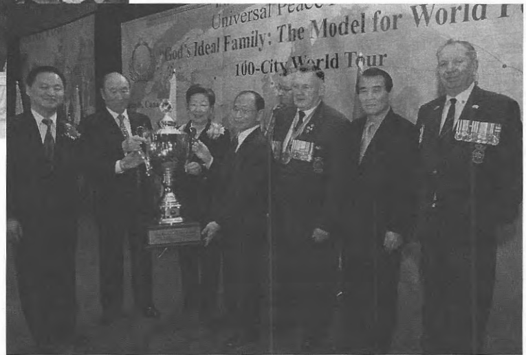
Celebrating the end of the 2005 tour with Korean war veterans in Toronto

moment, God is re-creating you as new people. The path is open wide for you to change your lineage through the Holy Wine Ceremony that the True Parents have instituted. The Blessing is yours, either as newlywed couples or as already married couples, that you may establish true families.