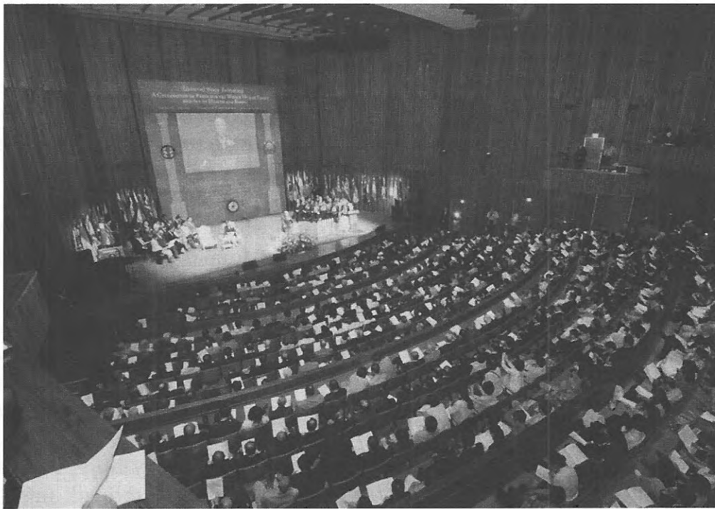
The Founding of the Universal Peace Federation at Lincoln Center, New York City, September 12, 2005