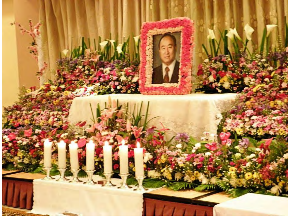
True Father's Seonghwa held in the Philippines in 2012

Beloved True Father, Remembering the observances of your Holy Ascension in 2012, we thank you for your many accomplishments since then. You have been praying for and guiding us towards the fulfillment of God's providence. Thank you, True Father, for your prayers and efforts for peace on Earth, for the reunification of Korea, for your guidance to world leaders who occasionally make terrible decisions, and for each of us. Thank you for supporting our health, safety and wellbeing. May everyone soon know the way toward the fulfillment of God's will.