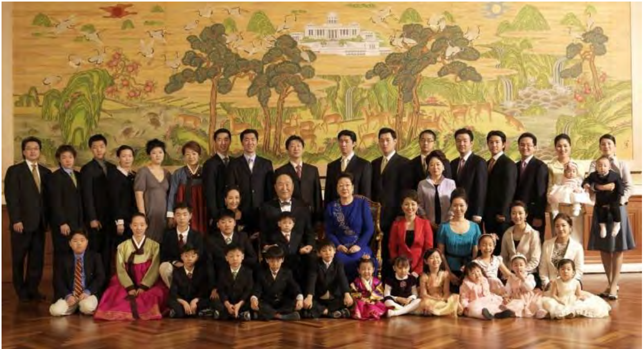
True Family in 2008

True Father, we're deeply grateful that you could talk with True Mother and many of your descendants during your final days on earth.