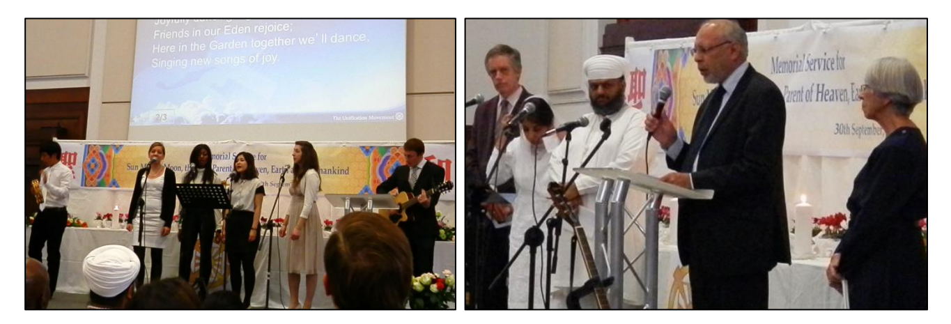
Music Ministry band – Interfaith representatives