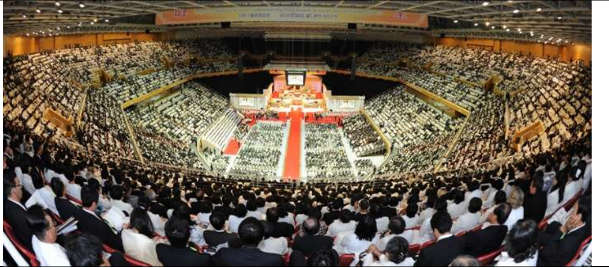
In addition the 50,000 mourners packed in and around the Cheongshim Peace Stadium, church officials estimated that millions more participated in the ceremony through live web broadcast and satellite programs in over 100 nations.

Rev. Sun Myung Moon, the international religious leader and founder of the Unification Church and the Universal Peace Federation was laid to rest yesterday in a series of moving ceremonies held in the mountainous countryside just outside Seoul that Father Moon loved so much in life.