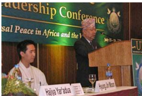
The Hon. Madhav Kumar Nepal, Prime Minister from 2009 to 2011, speaks of Nepal's quest for peace.