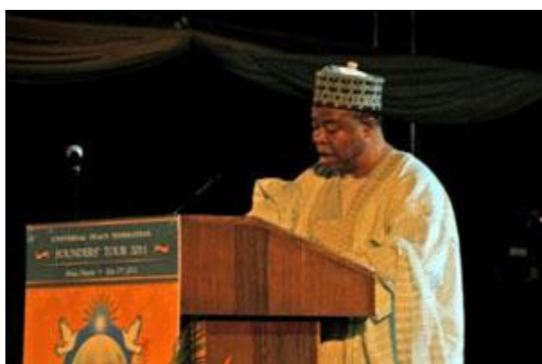
Welcome from the Hon. Ibrahim Nasiru Mantu