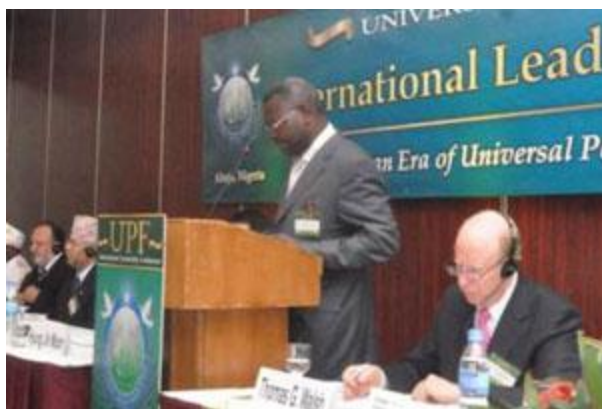
Former Prime Minister of Togo, Gabriel Messan Kodjo, addresses the Opening Plenary.