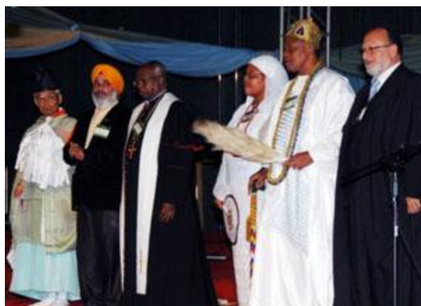
Leaders of six faiths offer prayers of peace to open the Peace Tour program in Abuja.