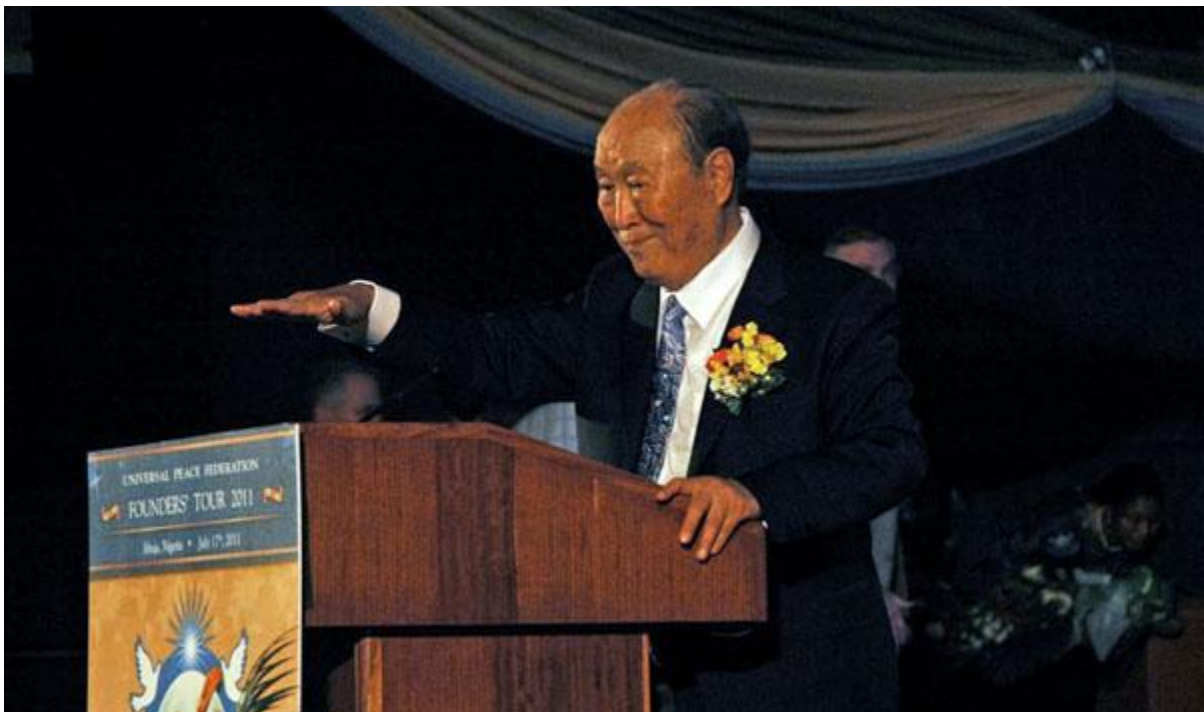
Father Moon describes a vision of peace for Nigeria based on stable families that love God.

"I have felt very welcome here in Nigeria," Father Moon said before beginning to read his peace message. "This country has a great potential, not just for itself but for all of Africa and the world." Yet, he went on to explain, the real resources of a nation are not external things such as oil, minerals, and water. Even Nigeria's vast human resources—one in four Africans is a Nigerian—have little meaning if not centered on God. "What use is even a Nobel prize," he continued, "if it is not used for the sake of peace?"