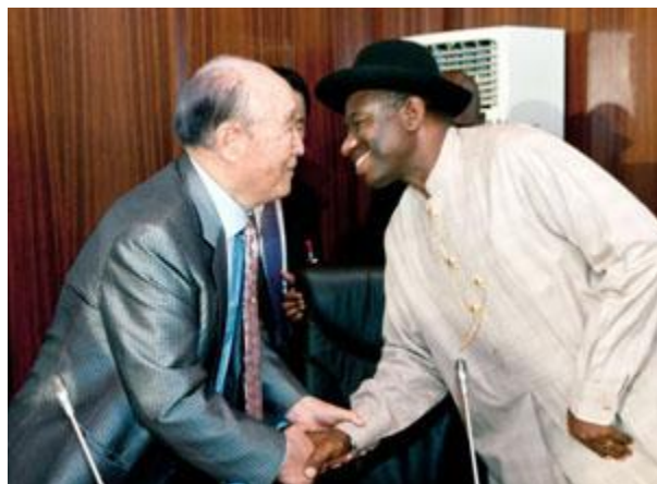
Father Moon shares a warm greeting with Nigerian President, Dr. Goodluck Jonathan.

Africa's most populous nation is surely in need of a new vision, and many challenges face President Goodluck Jonathan, who after the recent elections is currently negotiating the difficult task of assembling a cabinet and government that can embrace all Nigeria's cultural, religious, and ethnic diversity.