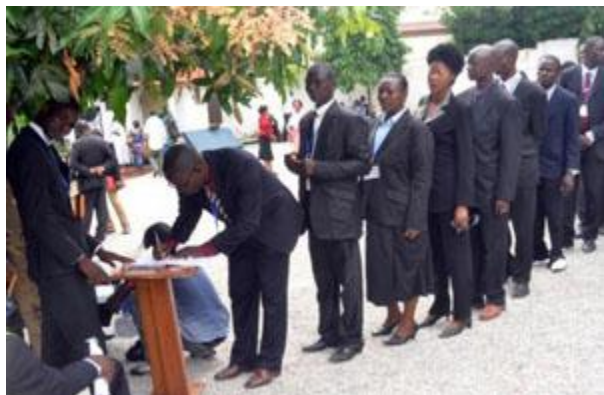
Nigerians line up for tickets to the main program.

The Universal Peace Orchestra, who had traveled many hundreds of miles from the city of Port Harcourt in the South, offered a stirring rendition of the Nigerian national anthem, and religious leaders of five faiths offered invocations and prayers for peace.