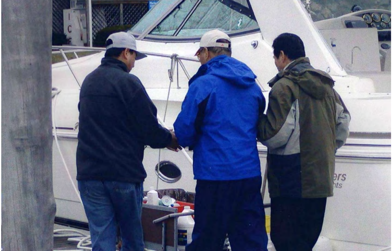
On April 22, 2003, even when True Father had not recovered, True Father insisted to go fishing at Hudson River, even though He could not walk without being supported by two people.

March 17th, 2003 - True Father became ill and was hospitalized. (I was told at the time, that True Father had taken ill because of the war in Afghanistan and later in Iraq, which was against God's Will.)