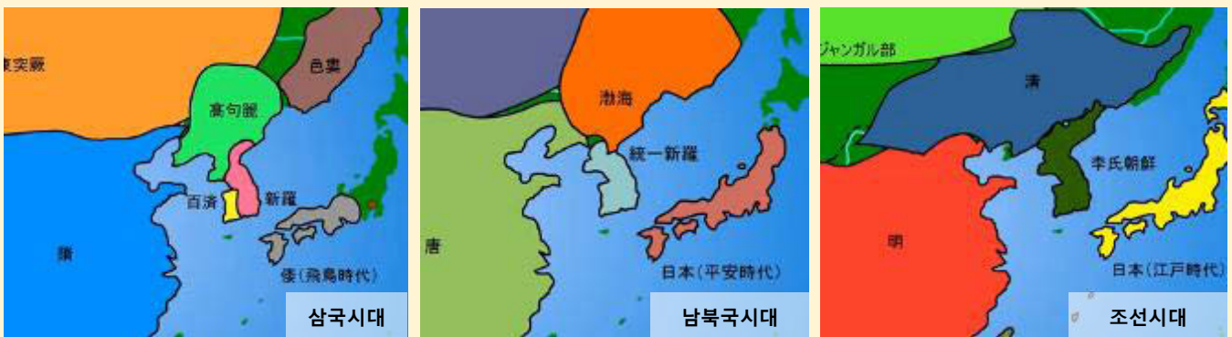
YouTube: 2000 Years of Eastern Asia