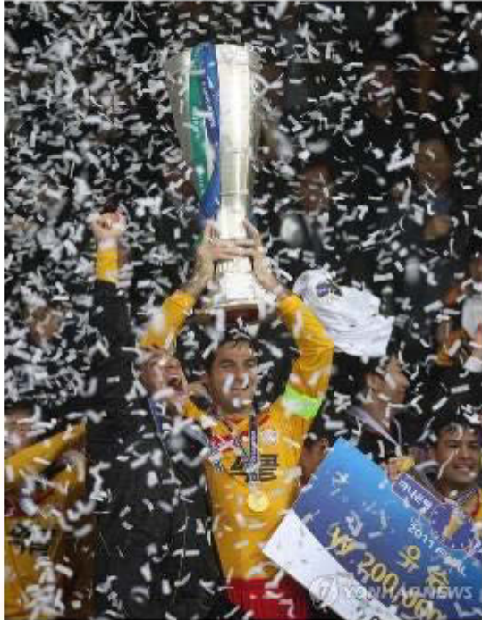
5일 경기도 성남 탄천종합경기장에서 열린 2011 하나은행 FA컵 결승 성남일화와 수원 삼성의 경기에서 성남이 역승을 차지한 후 선수들이 이채하고 있다. 2011.10.15