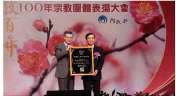
(서울=연합뉴스) 황윤경 기자=재단법인 통일교 대만총회(대만 통일교)가 대만 행정원으로부터 행정원장 특별상인 ‘100년적 우종교단체(100年績優宗教團體)’ 공로상을 받았다고 통일교가 18일 밝혔다.

대만 행정원 산하 내정부는 대만 건국 100주년과 종교활동보상 100주년을 맞아 내정부에 등록된 1만 5천여 개 종교단체 가운데 통일교 등 자선·봉사·사회교육 분야에서 공헌이 큰 4개 종교단체를 선정, 비 상을 수여했다.