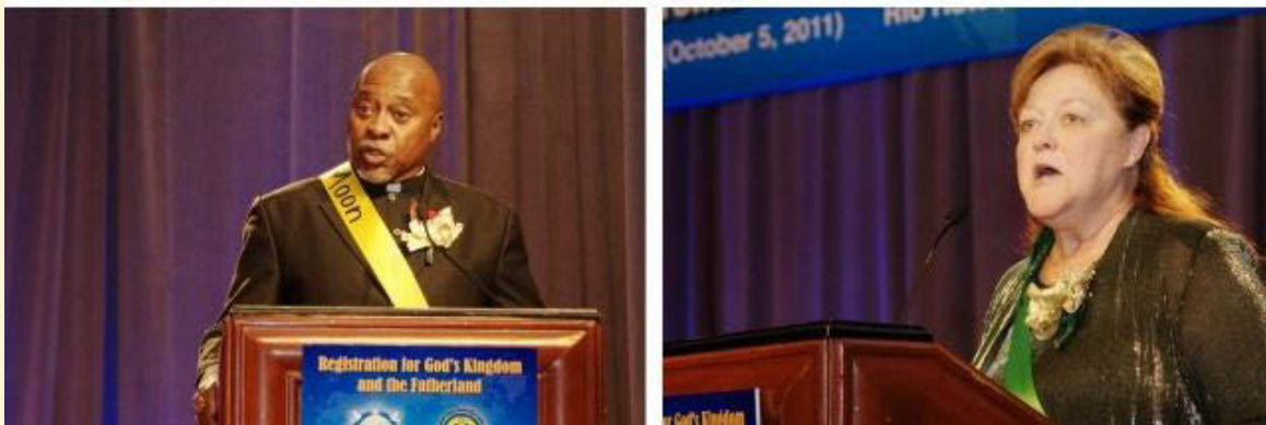
Representatives of 172 clerics giving reports on the Registration Rally held in Korea