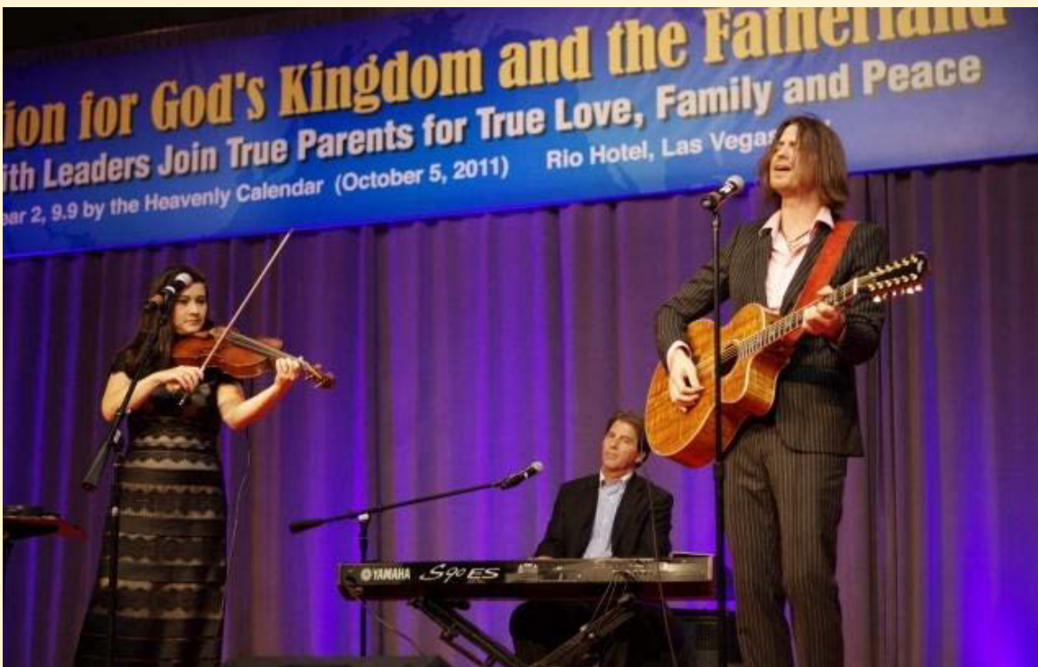
Congratulatory Performance: Sonic Cult from New York