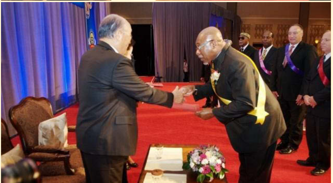
True Parents presenting representatives of American members of the clergy with surname certificates