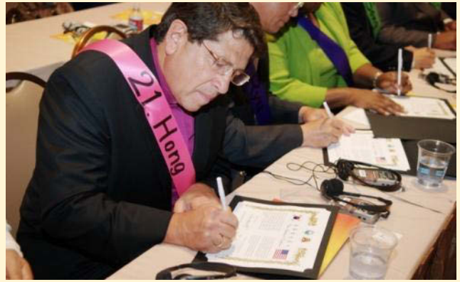
Establishment of sisterhood between representatives of Korean surname clans and American clerics