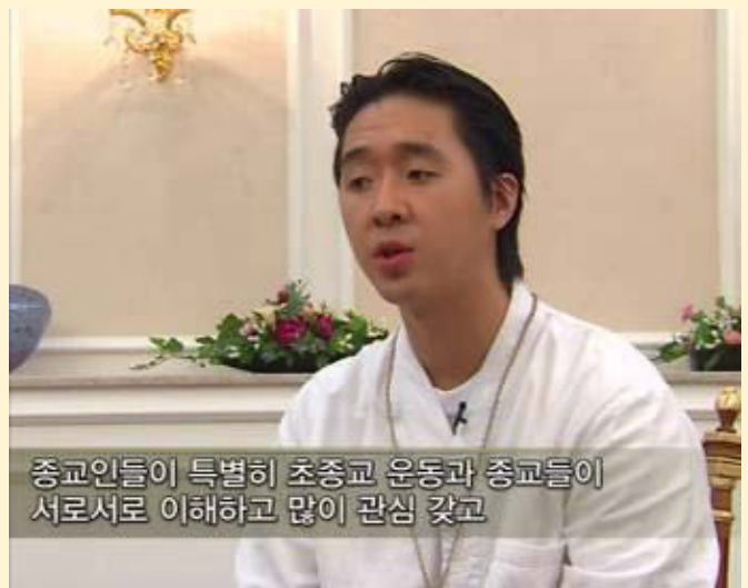
종교인들이 특별히 초종교 운동과 종교들이 서로서로 이해하고 많이 관심 갖고