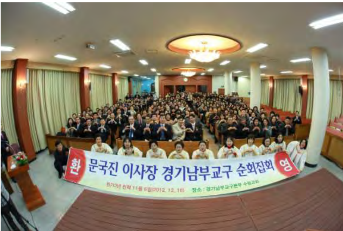
Group commemorative photo