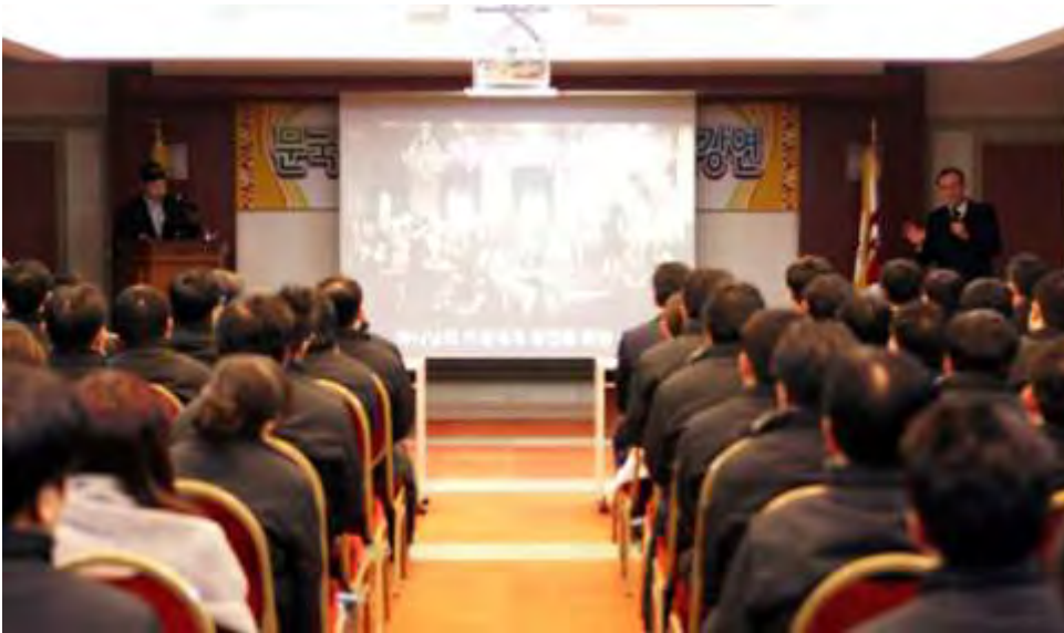
The Ilhwa Main Hall filled with Ilhwa employees