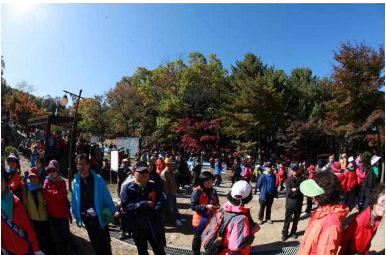
Participants for the rally for 'Strong Korea'