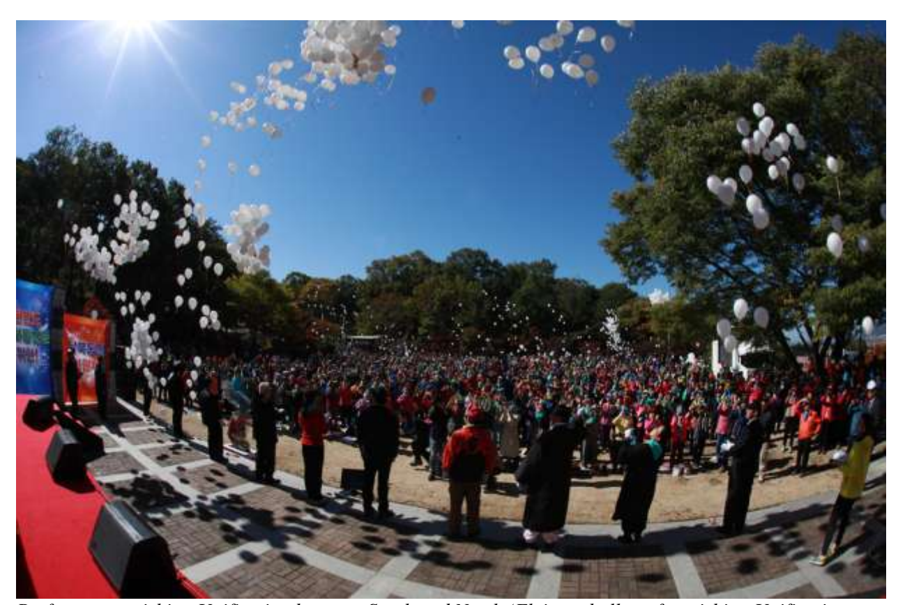
Performance wishing Unification between South and North (Flying a balloon for wishing Unification between South and North)