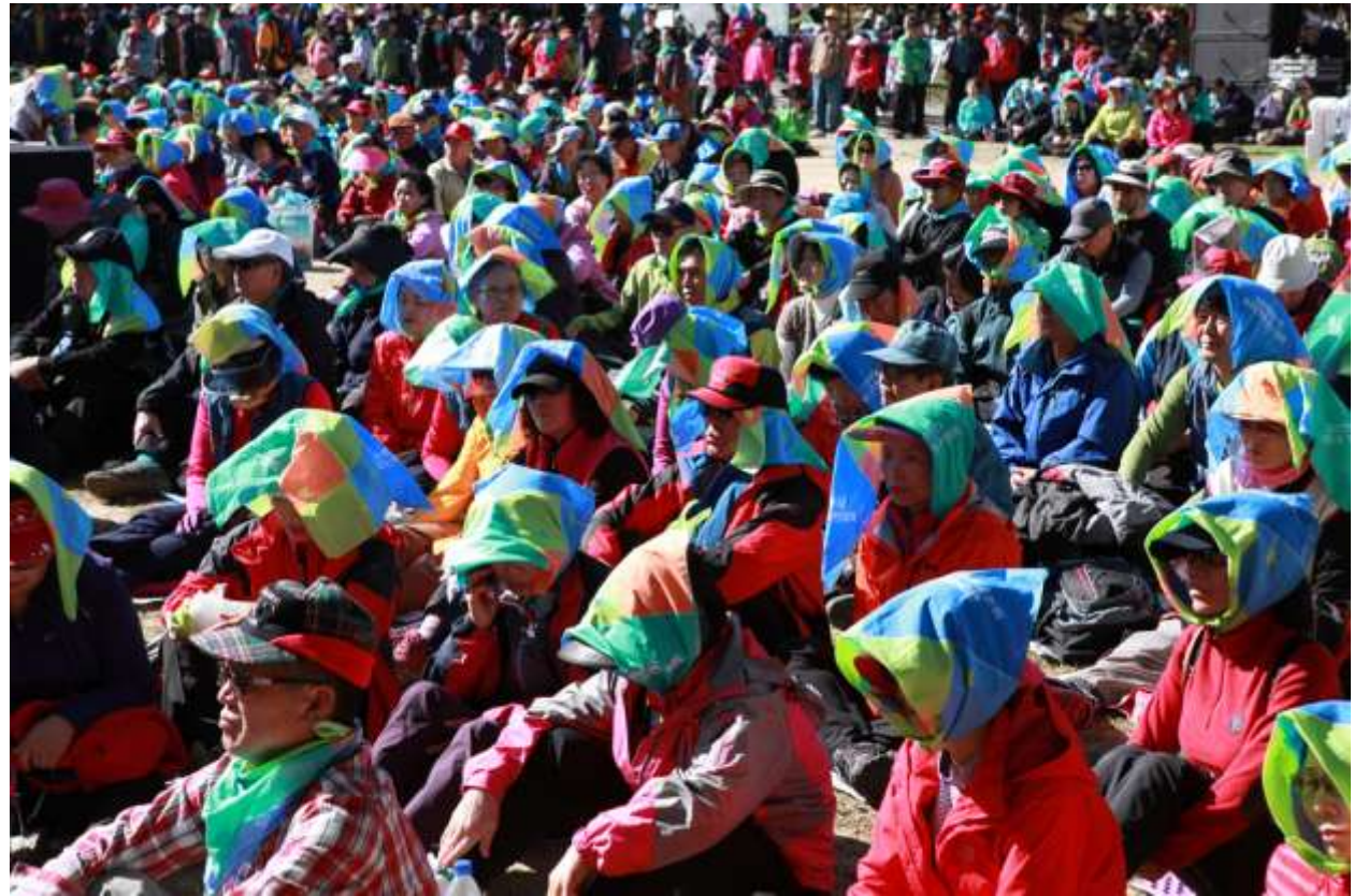
Participants listening to the speech