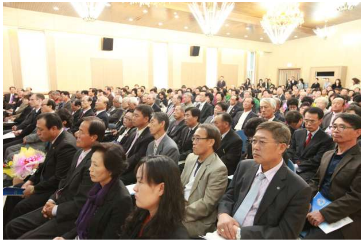
Audience listening to the lecture