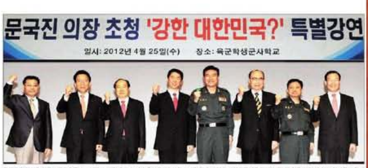
대한 강한 대한민국 반국민은동본부 의원이 25일 중쪽 고난군 육군학생군시학교 대강당에서 '강한 대한민국'을 구제된 독생강간을 마친 뒤 당석 인사들과 함께 대통향하 하고 오다. 영후부터 김명가 신문고 이태. 강기에 서울포함 회장, 중심로 강한 대한민국 한국민단증본부 회장, 중 의장, 강한선 역문학원스제학교 교장, 고반소 한국문학 원칙 왕도 반면기 유전학원스계학교 교수자를, 중요로 통합기회 사무증상