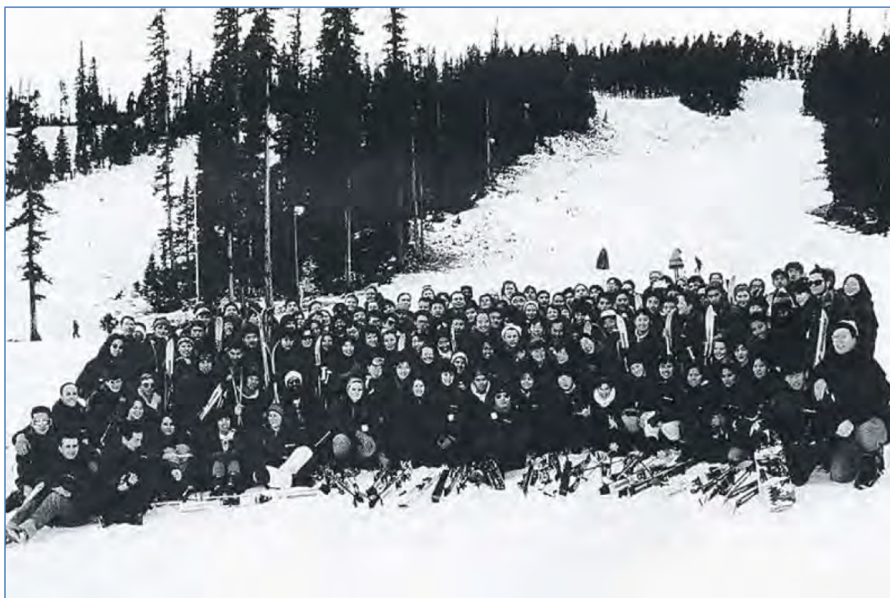
World CARP seminar participants prior to skiing

Look at Heavenly Father and True Parents. How were True Parents able to survive so many years, sacrificing so much, living a superhuman lifestyle, sleeping two hours a day? Father always talks about children being better than their parents. This is the parent's desire. A few days ago we were telling him, "Father, there is no way we can be like you! You are the only set of parents. No one can become like you. You are the greatest!"