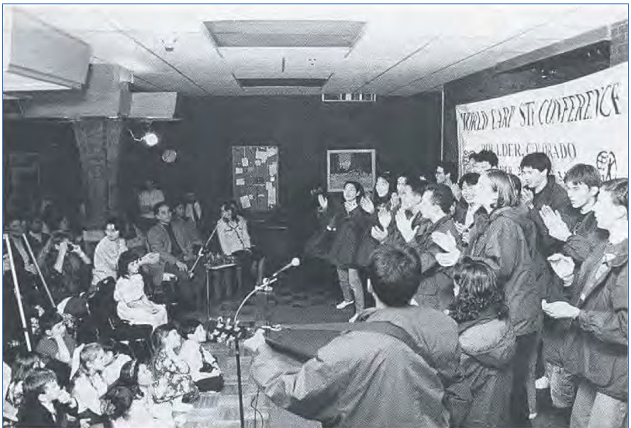
Participants join together in song

Father is a very principled person. He said, "I will abandon my family a hundred times over if they become a burden." You heard how he turned away his mother at Hungnam prison, telling her: "If you are going to be a burden to God's providence, go away." He can be that tough even to his own children. Pray about this.