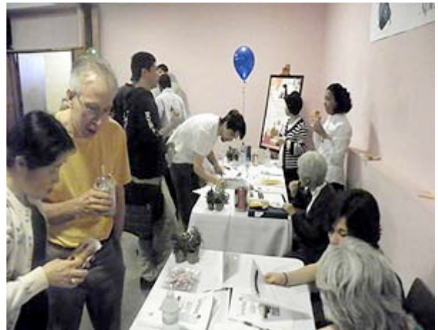
Spring LAUNCH Party Seattle, Washington

The 5 purposes of the ministry: Inspire, Empower, Connect, Contribute and Inherit are a constant but the face of the ministry needs to stay fresh and interesting. If a company wants to keep the attention of their customers, they come out with a new product, have a sale, or create a new promotion in their store. We are not a company, we are a church and our message stays the same. But we too need to change it up each quarter to keep our community engaged. Last Spring the theme of the quarter was "I Care" and LAUNCHpad was packed full of materials and resources to help communities utilize the theme. Members in Sarasota, FL showed they care by helping remove invasive plants disrupting the native wildlife in Myakka River State Park