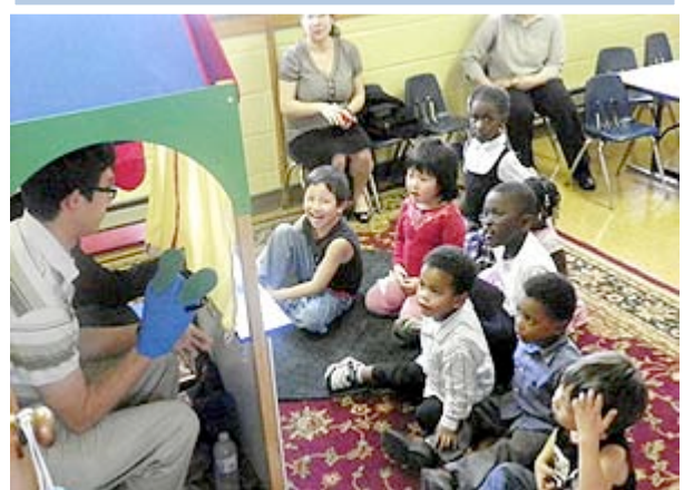
Spring LAUNCH Party Columbus, Ohio