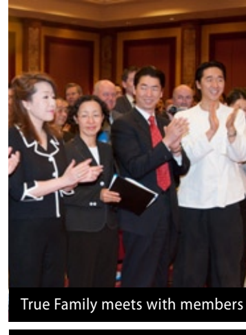
True Family meets with members