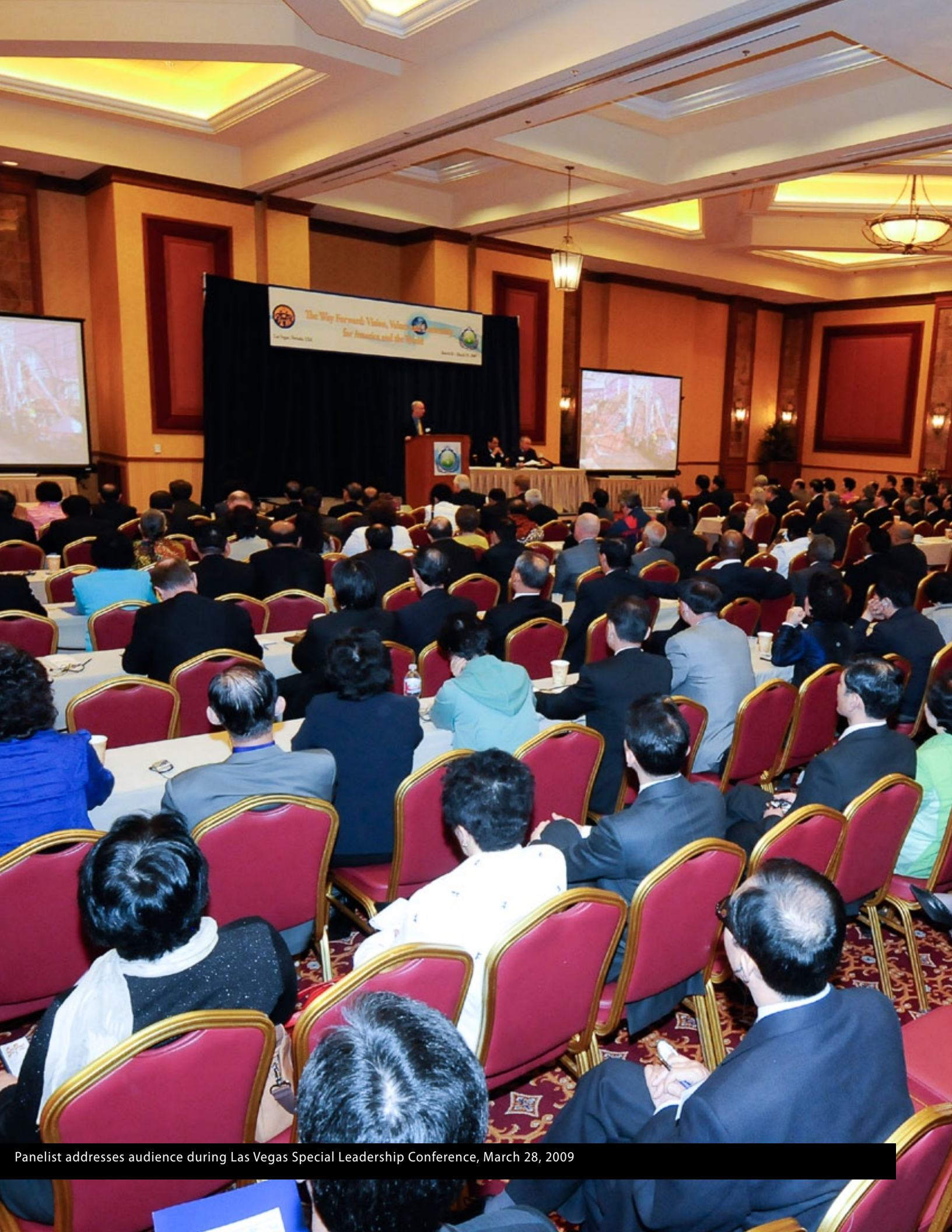
Panelist addresses audience during Las Vegas Special Leadership Conference, March 28, 2009