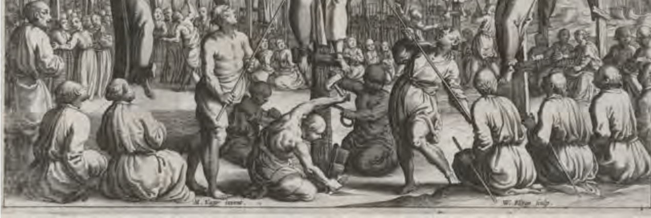
Christians crucified in Nagasaki in 1597, engraving by Wolfgang Kilian (1581–1663).