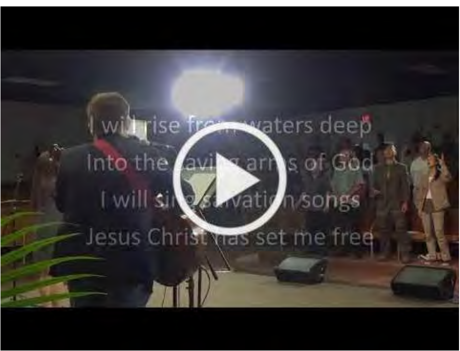
Unification Sanctuary Sunday Service 7/14/2019

He discussed the state-sponsored killing of children in ancient Carthage, which continued Baal worship of the Canaanite religion, explained in the new Our Father Forsaken book. The historicity of such crimes are confirmed by different historical sources. These practices are similar to current government sponsorship of abortion through the billions of dollars given to Planned Parenthood.