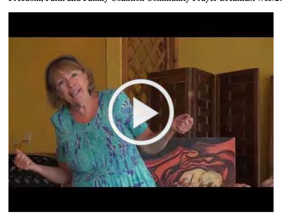
"The Voice of John" Part 1