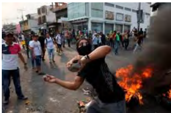
Venezuelans demonstrating against Leftist Government

That is why I don't see this as an issue of "name-calling." Her ideas are unprincipled and dangerous. Socialist governments killed hundreds of millions of people in the last century , most of whom were disarmed through gun control laws that were enacted under the banner of "fighting crime" and "reducing violence."