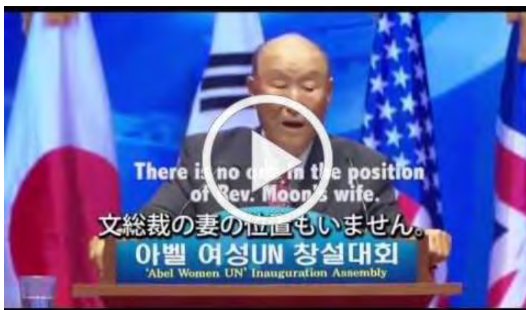
True Father's Abel UN Speech 2012-7-16 "No Mother"

In video 7 of the first day, the following video of True Father's statement at the Abel UN Inauguration Assembly speech on July 16, 2012 was shown to the Han Mother that "there is no one in the position of Rev. Moon's wife." She testifies that she was not aware of these words