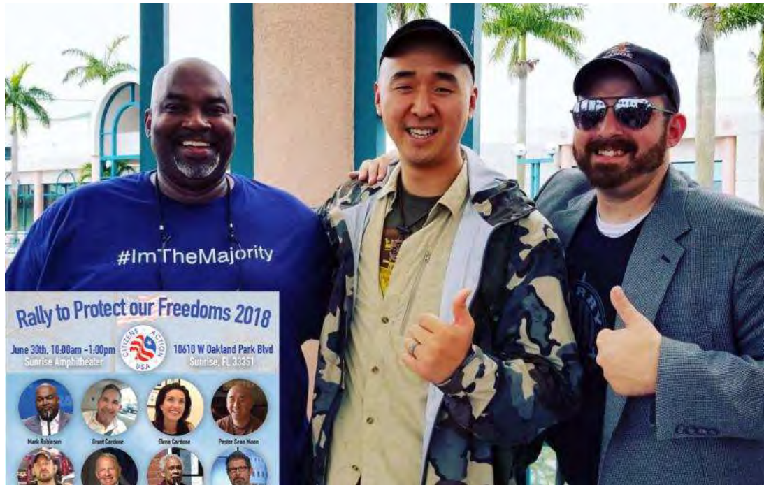
July 1, 2018 Unification Sanctuary Service Newfoundland PA

When we talk about God's standard the world calls us a "cult." We all need to repent for the compromises we have made in upholding God's standard.