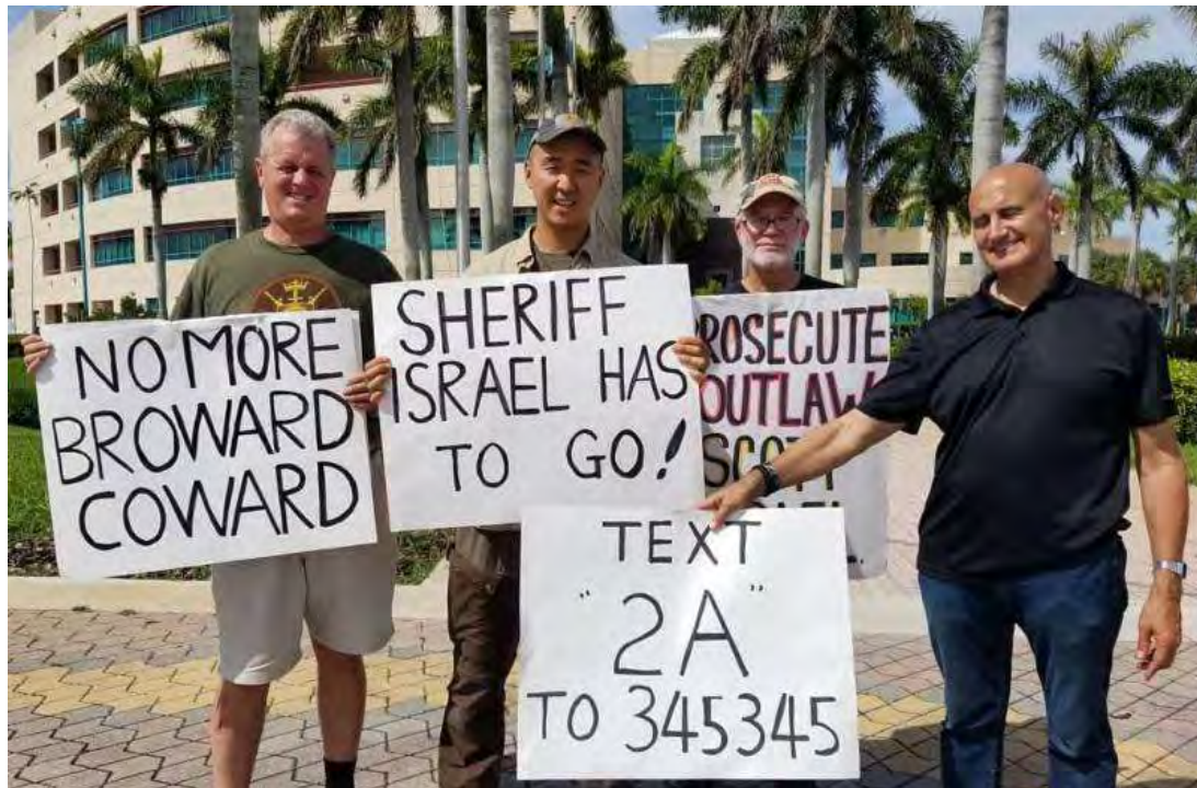
Rally at Broward County Sheriff's Office