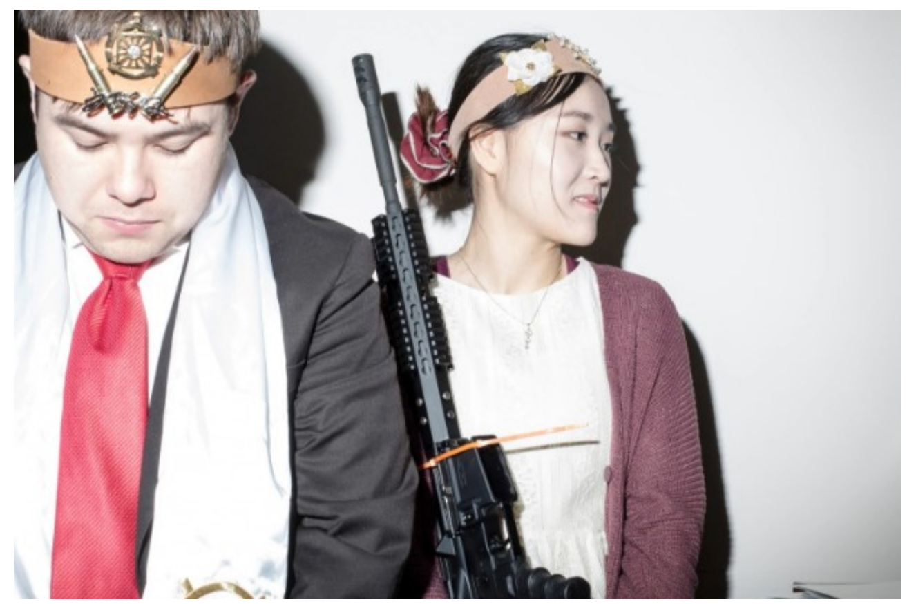
Members of the church during a blessing ceremony in February.