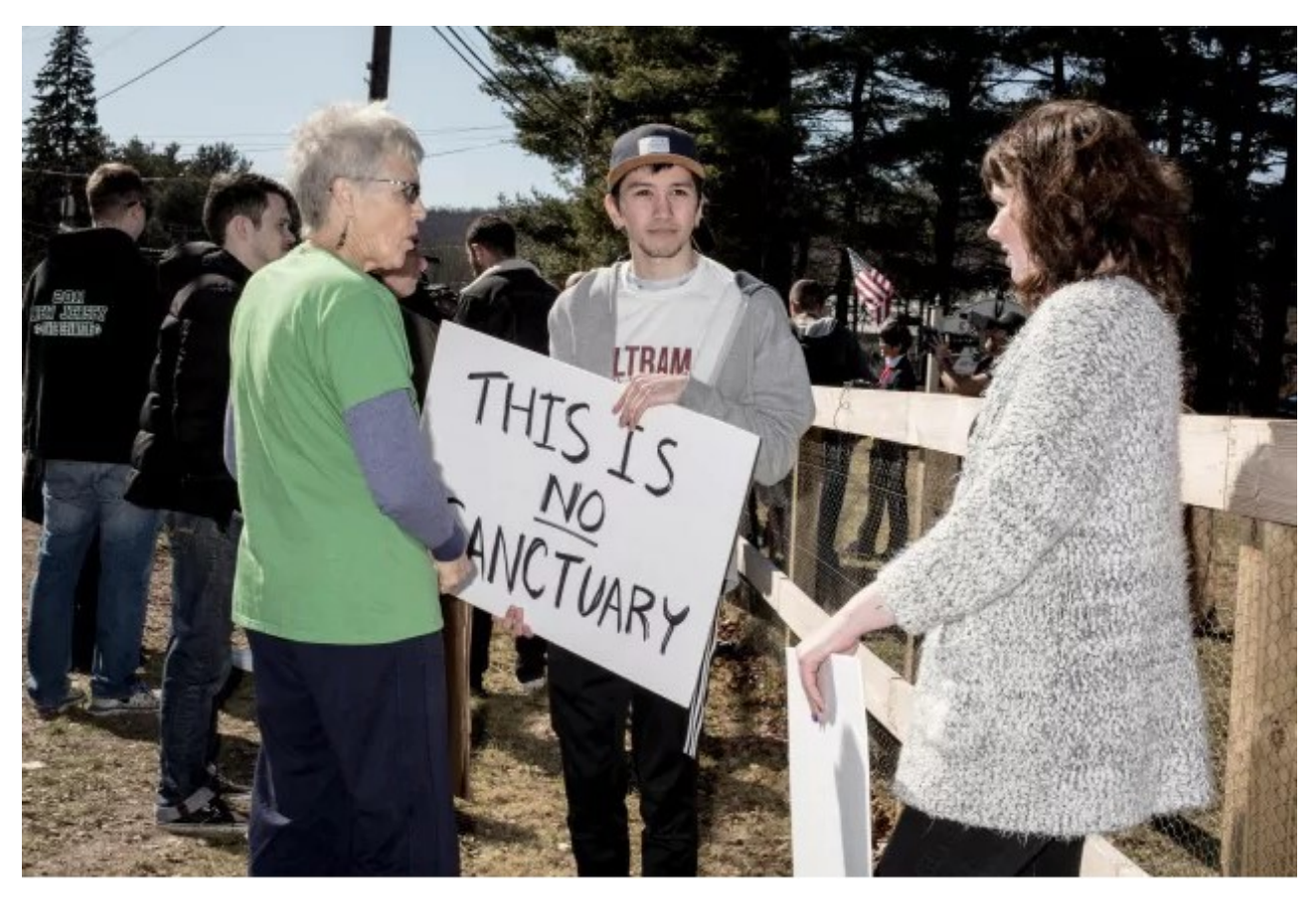
A group of protesters outside Sanctuary Church.

The brides and grooms in attendance, some 500 total, jointly sipped from tiny cups of wine. They took their vows ("Do you promise an eternal bond as husband and wife?"). The King said an extended prayer, acknowledging their "right to sovereignty, the right to keep and bear arms, the right to inherit the earth and protect it from socialism, communism and political Satanism." Husbands and wives then exchanged rings. The sanctuary filled with applause, then cheers.