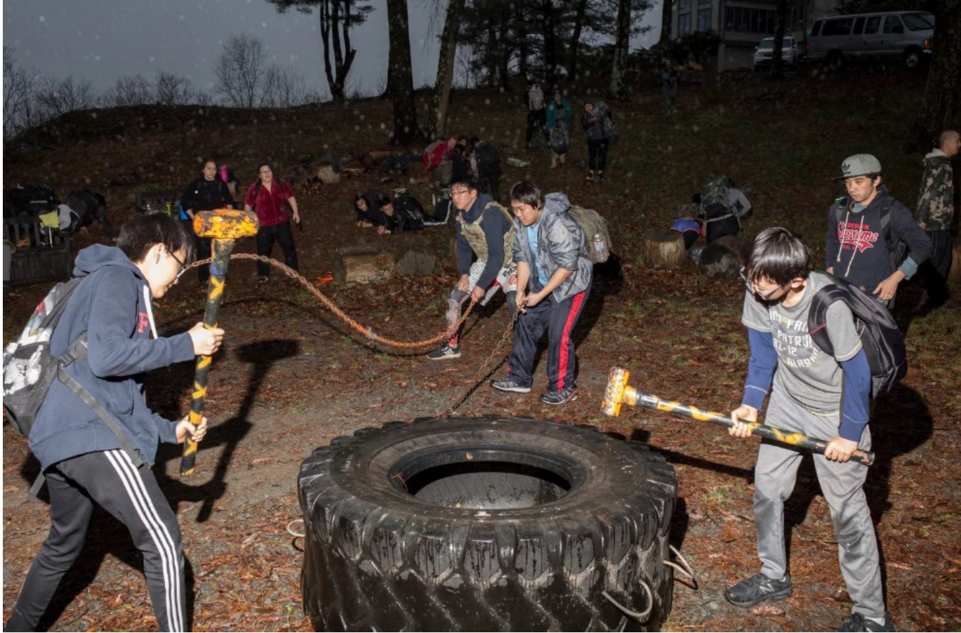
Church members do outdoor circuit training. Some members are part of the church's Peace Police/Peace Militia.