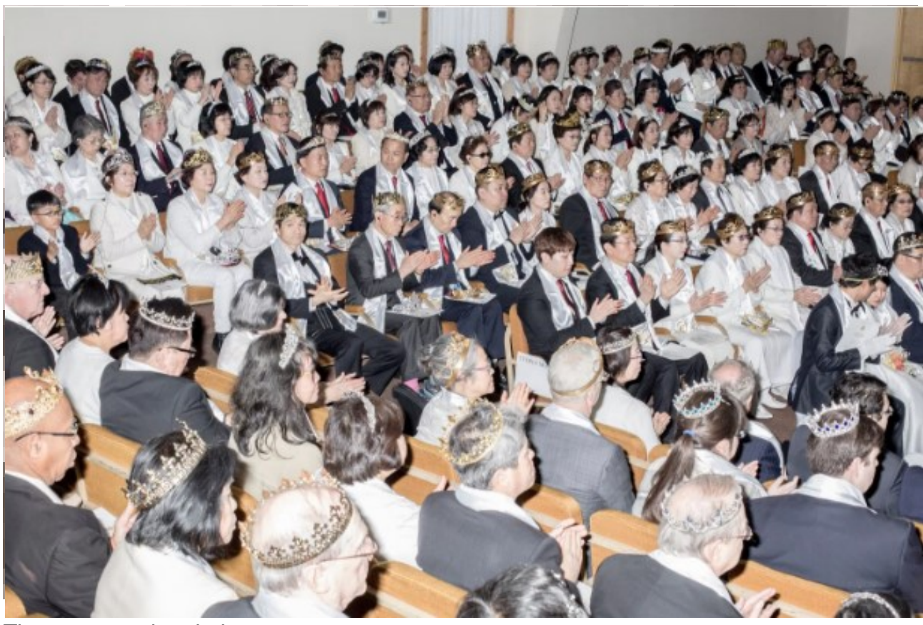
The congregation during a sermon.

This crowd was about twice the usual size because this service was the warm-up for a renewal-of-marriage-vows ceremony scheduled for Wednesday morning. Scores of couples already had arrived from Japan and Korea. That ceremony — officially, the "Cosmic True Parents of Heaven, Earth and Humanity Cheon II Guk Book of Life Registration Blessing" — would cap a week of activities that thus far had included an arts festival, a survival skills contest and a goat-butchering demonstration.