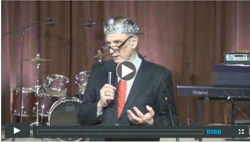
Sunday Service - February 4, 2018 - Unification Sanctuary, Newfoundland PA

At the present, the Blessing is being carried out within the Church because we do not have a nation, but in the future we need to be registered in the nation. You can be registered only when you have fulfilled your responsibility as tribal messiahs. By being registered in the nation and the world and becoming one with True Parents, then, with them as the subject and Blessed Families as the object partners, you need to dedicate your families to attend God. Only then can the cosmic ideal of Blessed Families be formed. Such is the Kingdom of Heaven on earth and in spirit world! Amen!