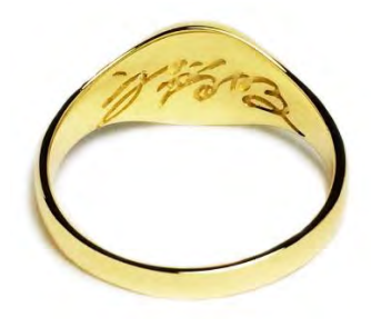
BA450 $185.-Ring top width 5mm