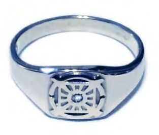
Band: BA460 $225.-Ring top width 6 mm (below)