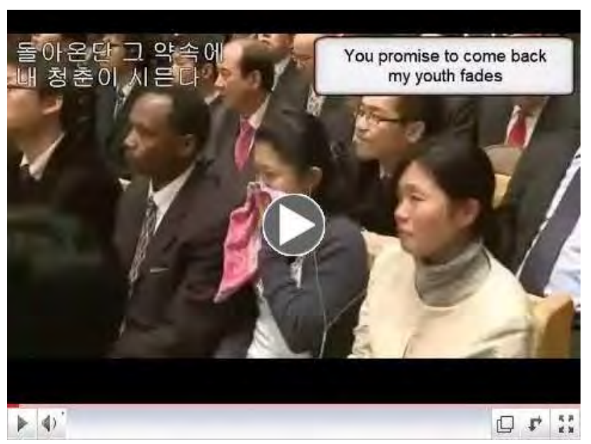
True Father on 3/7/2010 "I could not meet my bride."