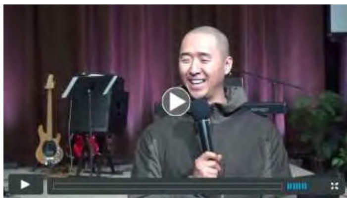
The Kingdom Born Again - Jan. 22, 2017 Sanctuary Service