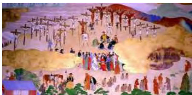
17th Century Japanese Christian Martyrs

Am I wrong to understand that those who do not attend the public ceremony or write an enthusiastic resolution form are identified as not accepting the new Born Sinless Only Begotten Daughter theology that has been imposed on the Unification Movement since Father's passing? Am I wrong to understand that the district pastor will have a list of those who do not attend the public ceremony or write a half-hearted resolution form?