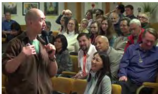
"The Kingdom Nature" May 22, 2016 Sermon