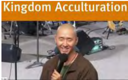
May 15, 2016 Sanctuary Sermon

A principled worldview is based on freedom, including pursuit of competition that must include acceptance of inequality or there is no real freedom, a free market, and strong families that invest in their children's development and success.