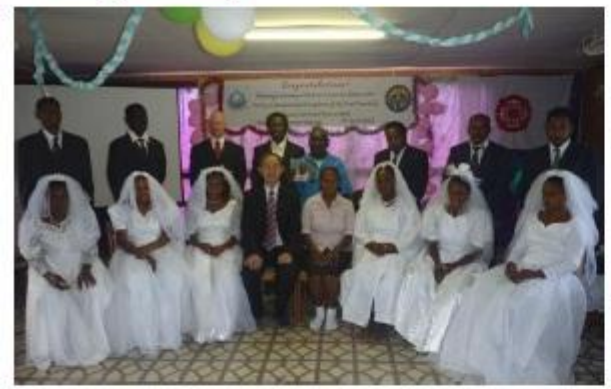
7th April, 7 Couples attended the Blessing Ceremony