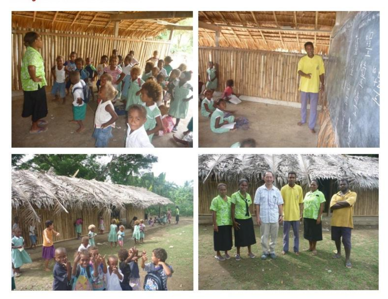
They have 60 children for kindergarten and 70 for primary school (class 1 to 5) students studying there.