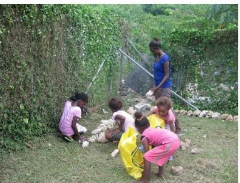
B.F.D helped collecting stones for the Kindergarten (New Hope Academy)