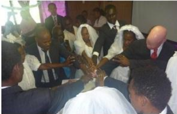
Blessing Cake Cutting