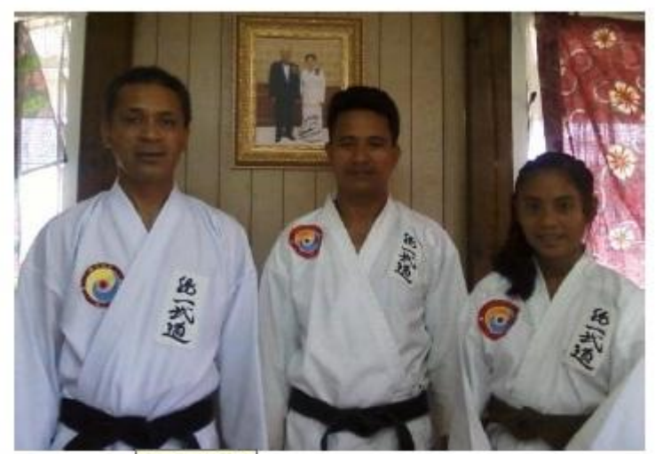
Inauguration of Unification Church in Magiagi, Apia. Tong Il Moo D Photo0052 working at National University of Samoa.