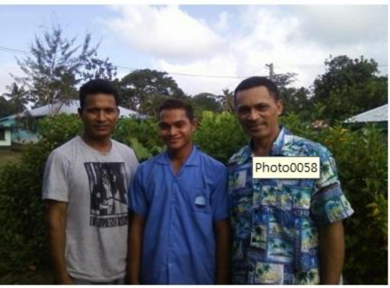
1-day and 2-day Divine Principle workshop for Lamauta&Apineru