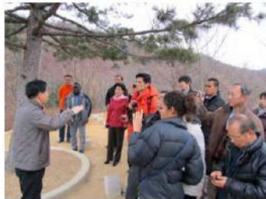
Trip to the Tree of Blessing at Cheong Pyeong to hear about the history of Cheong Pyeong and its special significance for True Parents