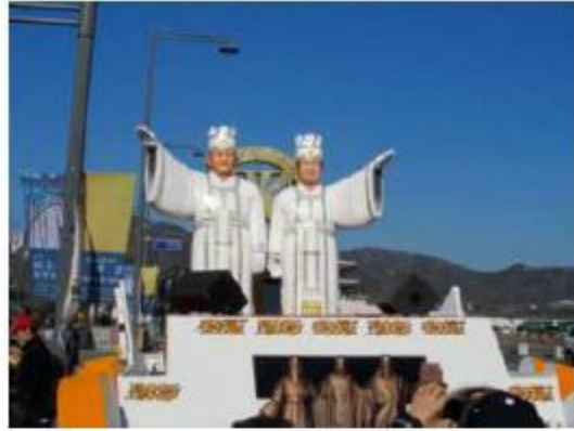
The float in the Parade through the streets of Seoul at True Parents' Birthday/True God's Day celebration