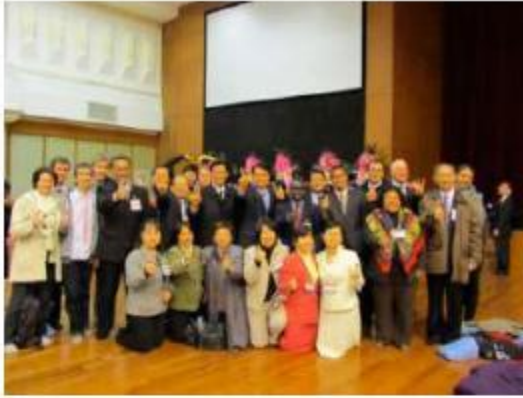
Oceania Leaders at Main hall in the Cheong Pyeong Training Center