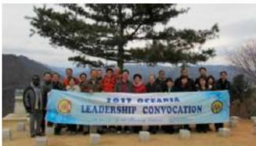
Group photo at the Tree of Blessing after strong prayer and commitment for 2012