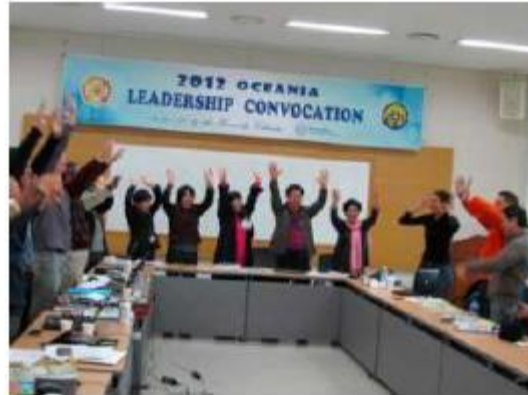
All leaders pledge for a great victory in 2012