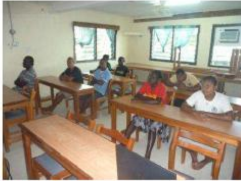
Weekend workshop participants