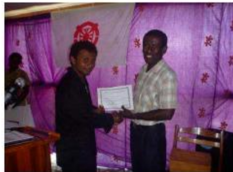
Workshop certificate presentation#3