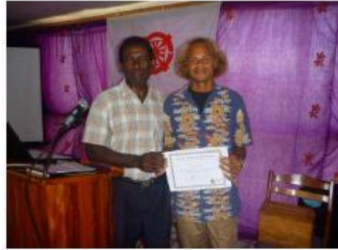
Workshop certificate presentation#1