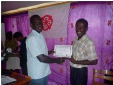
Workshop certificate presentation#2