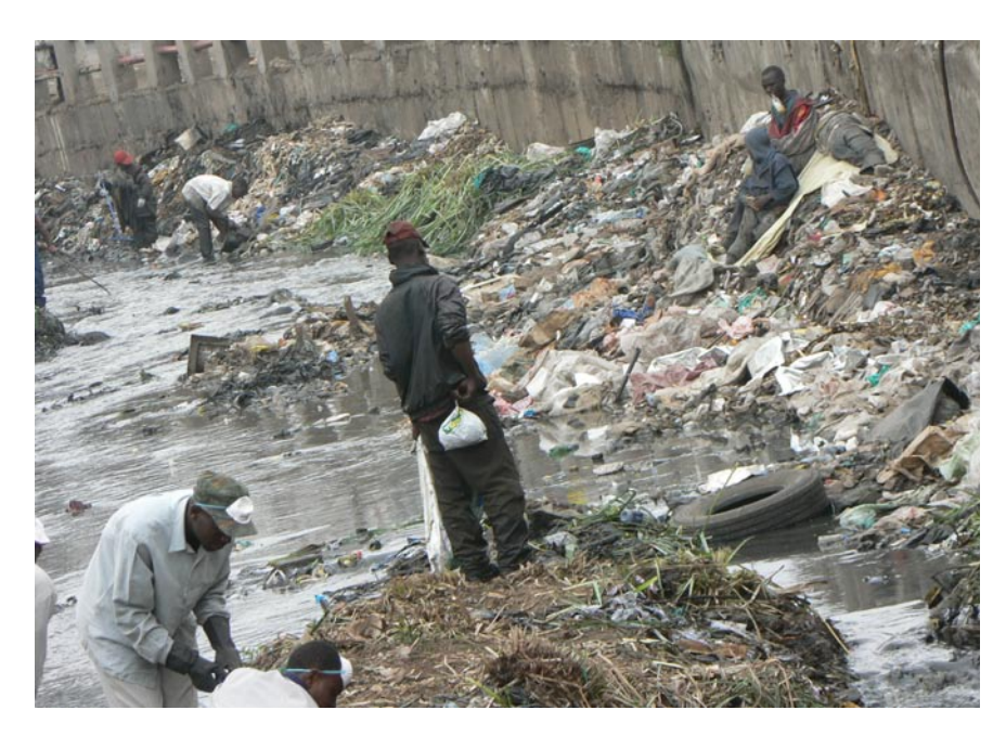
The river has been a symbol of civil neglect