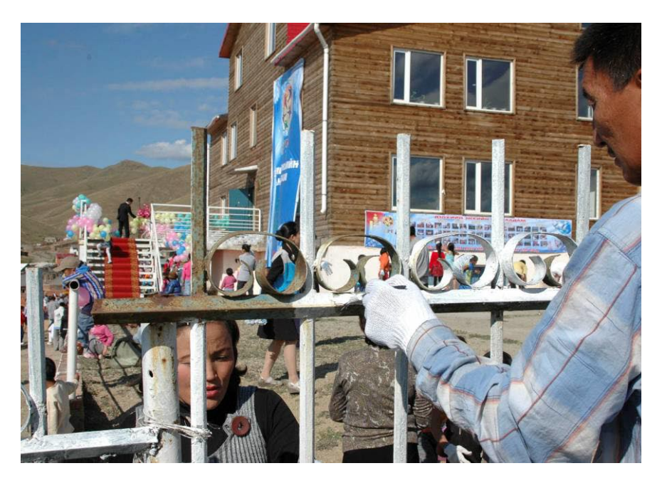
The service day at the Yargui Kindergarten sponsored by UPF and WFWP. Now in its 8th year, Yargui is the only school for hundreds of families living in near-slum conditions on Ulaanbaatar's dusty outskirts.

With over 50% of Mongolia's population now jostling for space in Ulaanbaatar, the city is facing a crisis as it struggles to make room. Most at risk are the children of new arrivals. The Women's Federation for World Peace has been providing schooling, clothing and meals at the fast-growing Yargui Kindergarten. Volunteers from the Global Peace Festival helped beautify and grade the school grounds, removing dangerous rocks and working with the children to paint cheerful murals pointing to a better future.