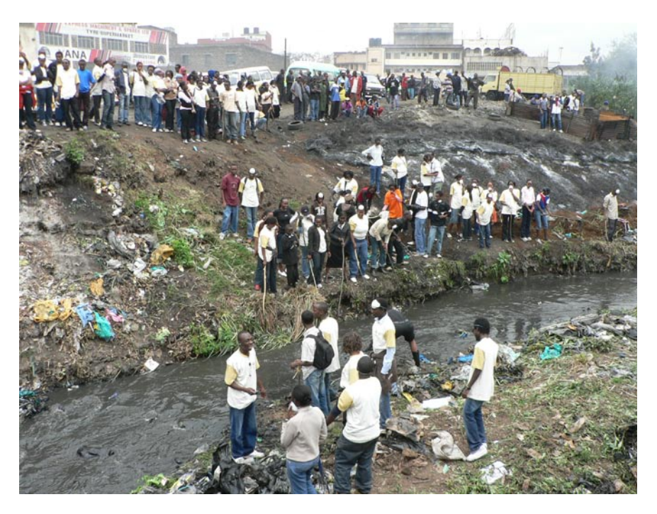
Volunteers clean up a section of the Nairobi River Bank in Embakassa, one of Nairobi's poorest neighborhoods

zens of the city have long been holding their noses and looking the other way. As a service to the Kenyan capital, the Global Peace Festival organized community-wide cleanup efforts in ten different locations throughout the month of August. Local activists said they plan to continue the project indefinitely.