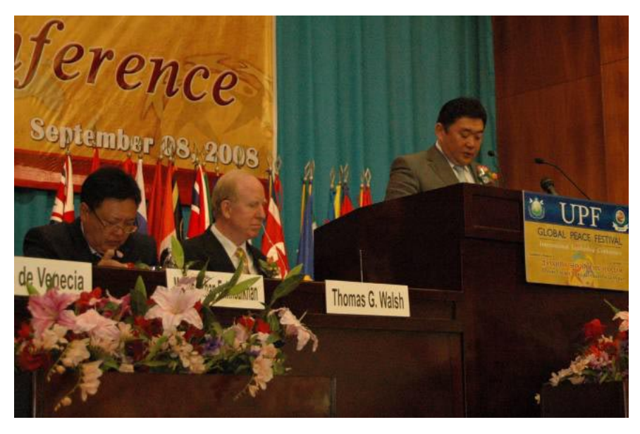
Mongolia's Deputy Prime Minister offers welcoming remarks.