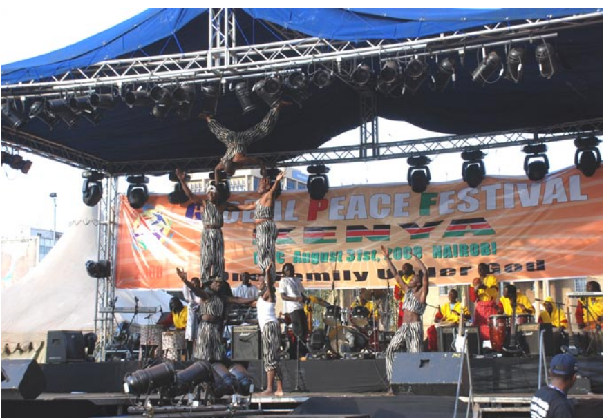
A young acrobatic team spell out P-E-A-C-E during the GPF entertainment