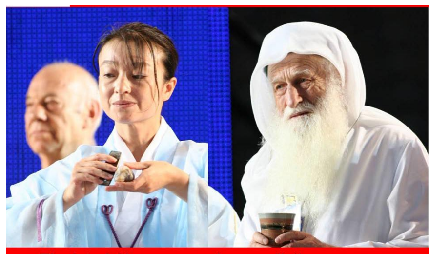
The interfaith prayer and reconciliation ceremony is a popular highlight of every GPF.