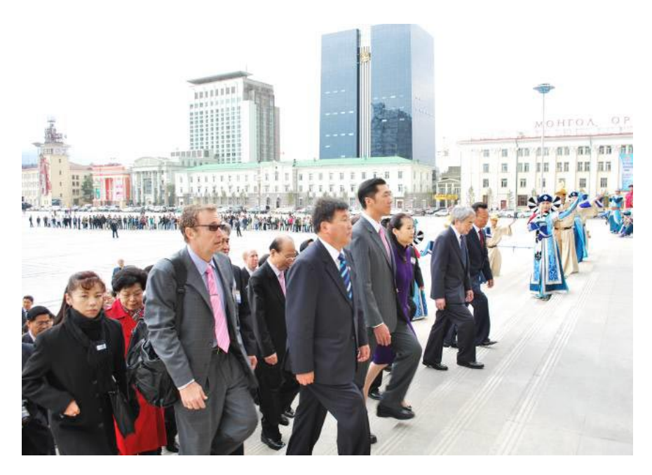
The 250 ILC participants were honored by a special ceremony at the Mongolian Parliament

In addition to widespread civic action, the Universal Peace Federation is committed to leadership education as an important step in bringing peace. The International Leadership Conference was attended by 250 delegates from 38 nations, including more than 20 former heads of state and senior government ministers from central Asia and from Oceania. "We need to find a better way to choose better leaders," said Stanislav Shushkevich, former president of Belarus and a member of the UPF Presiding Council, "and this peace education initiative can be an important first step."