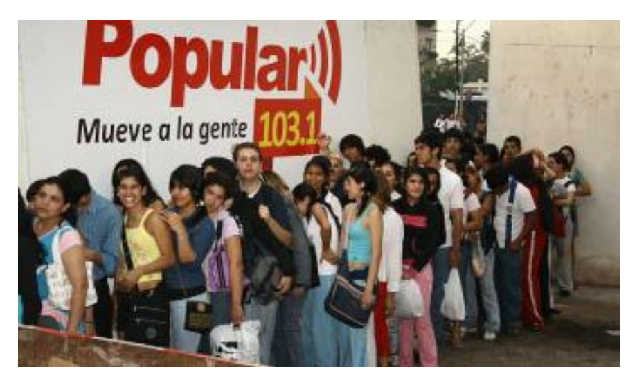
Thousands queue to donate at a local radio station

quickly ran out. When radio station Popular 103FM ran a contest to give away 1,000 tickets to people who brought a donation for poor children, more than 4,000 turned out and filled the streets around the station with cheerful teenagers hoping for the hottest ticket in town.