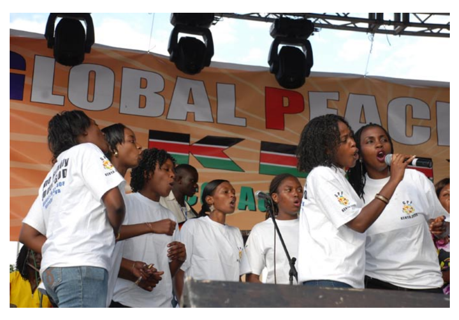
A local choir sings the GPF Anthem "Where Peace Begins" in Kiswahili