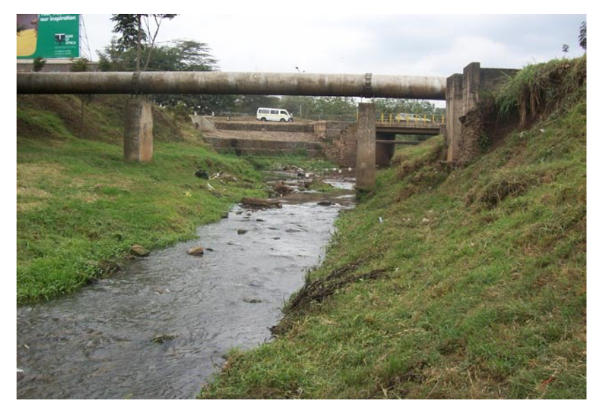
One section of the river reclaimed from the filth