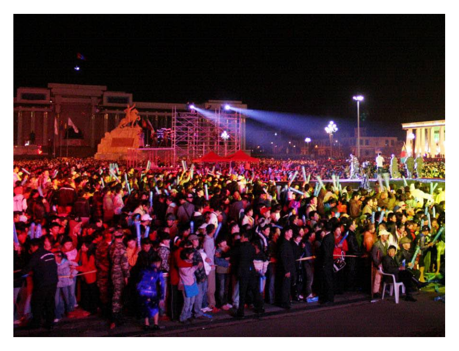
Braving rain, a huge and happy crowd fills Sukhbaatar Square in central Ulaanbaatar, marking a decisive turn away from division and civil strife to embrace the ideal of One Family Under God

In a moving and dramatic display of national pride and unity, the citizens of Mongolia made a clear commitment to peace and prosperity for their storied nation at the Global Peace Festival in Ulaaanbaatar. Just a few short weeks after disputed elections brought this landlocked Asian nation to the brink of civil war, Sukhbaatar Square was again filled with a huge crowd. This time, they sang and danced for peace.