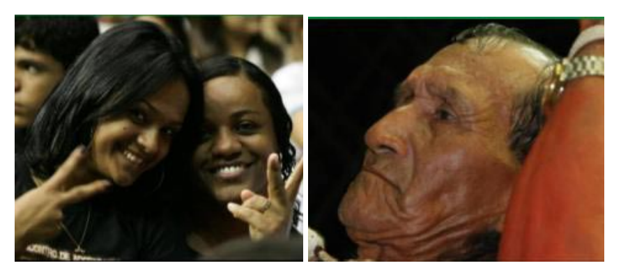
Faces in the crowd at the Global Peace Festival in Brasilia mirror happiness, reflection and commitment.