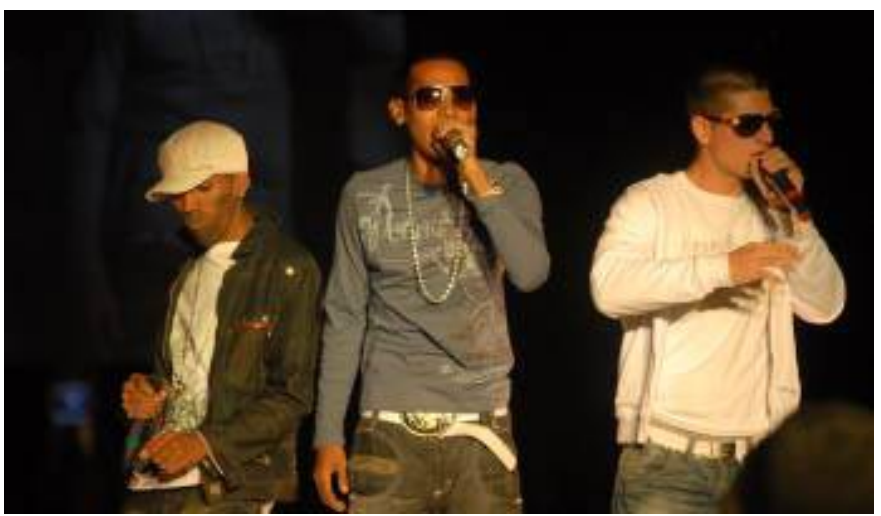
Cuban Rap sensations "Chapa C"