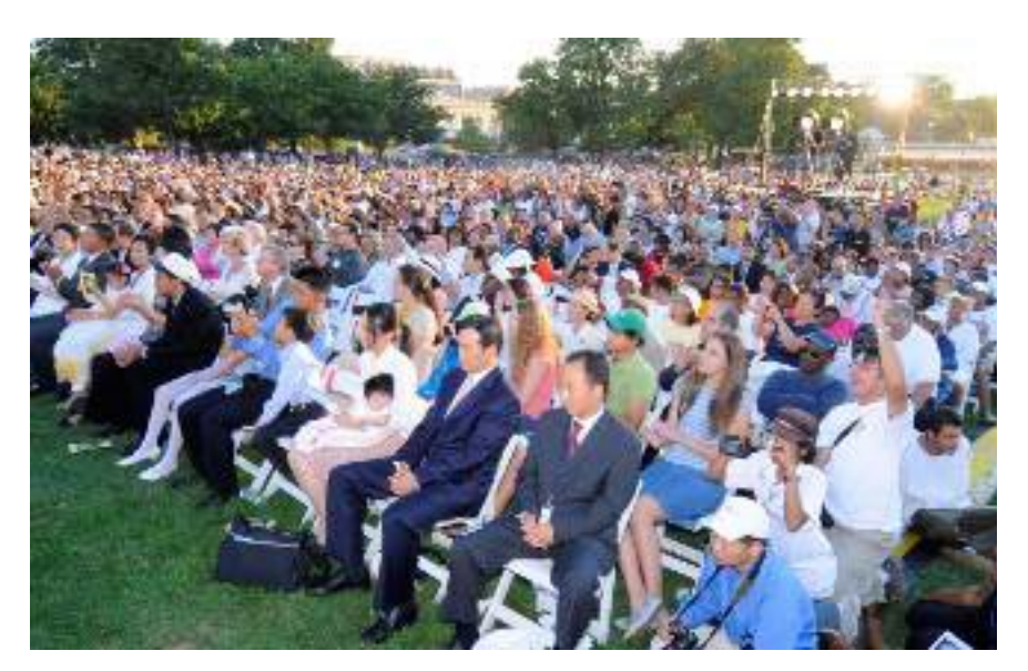
A crowd of many thousands listen to the keynote address