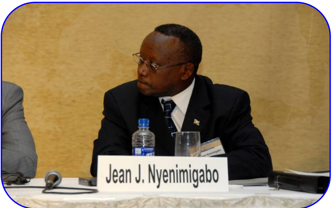
Jean Nyenimigabo, Burundi Government Minister and Parliamentarian For Peace