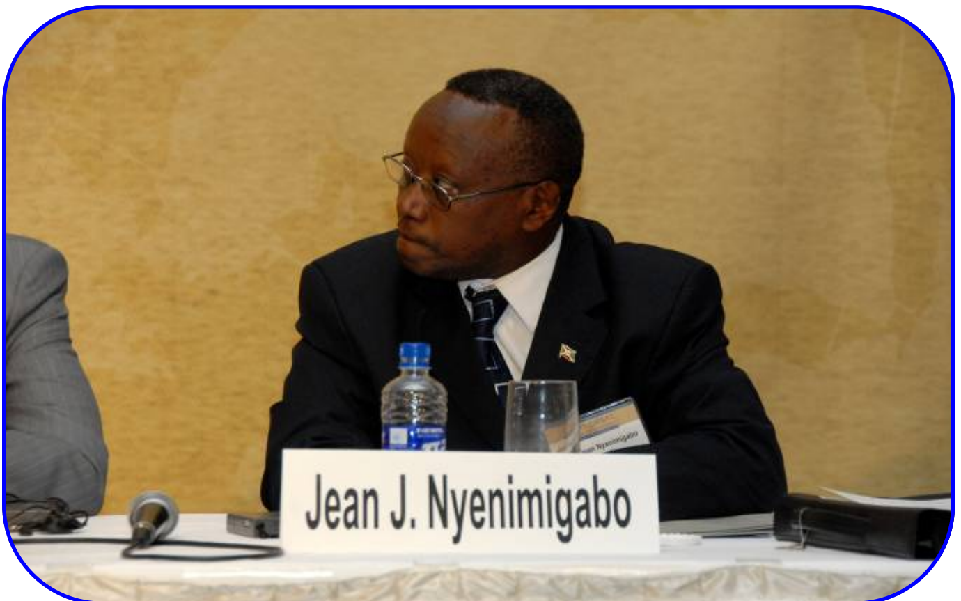
Jean Nyenimigabo, Burundi Government Minister and Parliamentarian For Peace