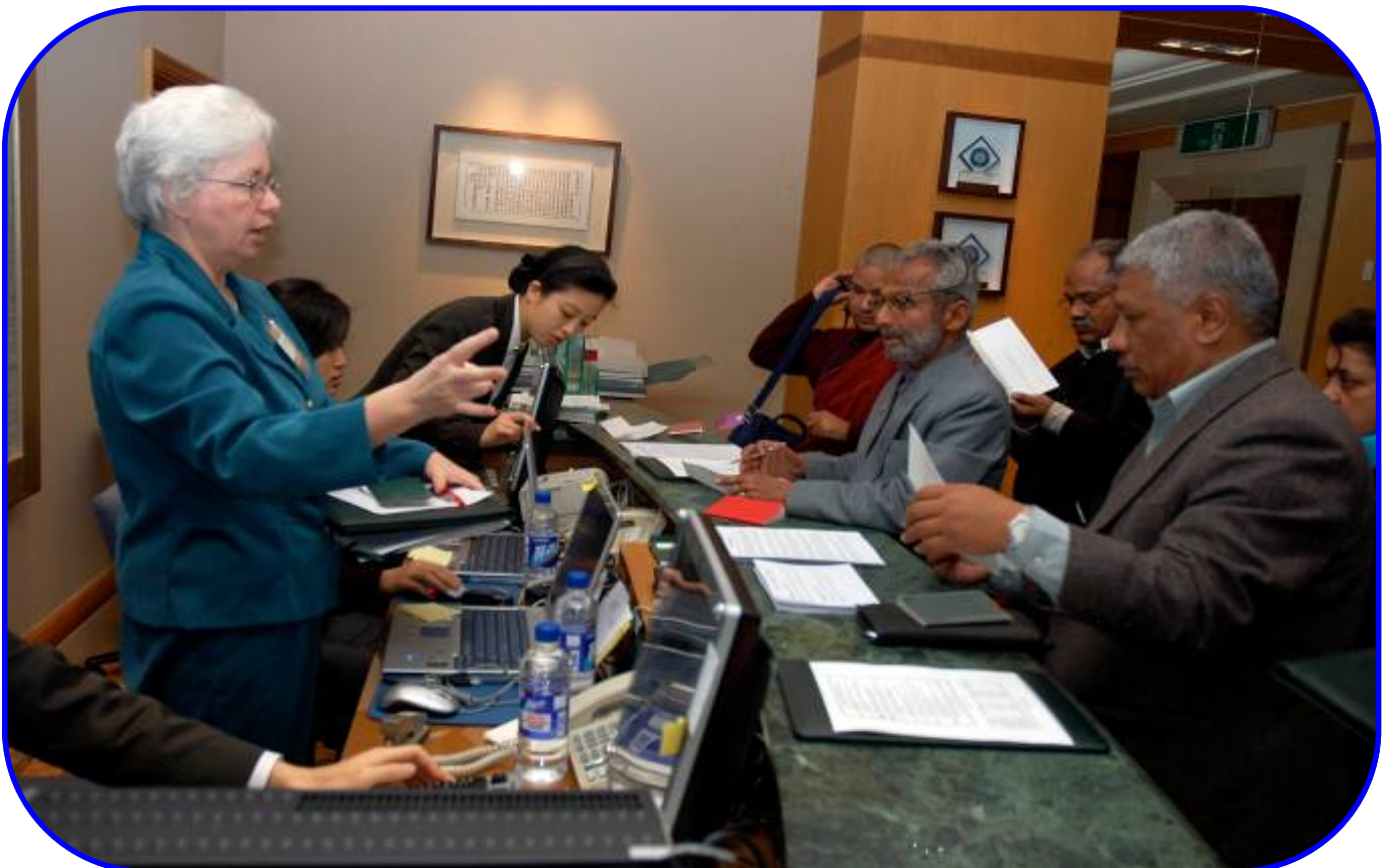
The UPF Staff register the incoming guests, who include Heads of State, First Ladies, Parliamentarians, Women leaders and Religious Leaders