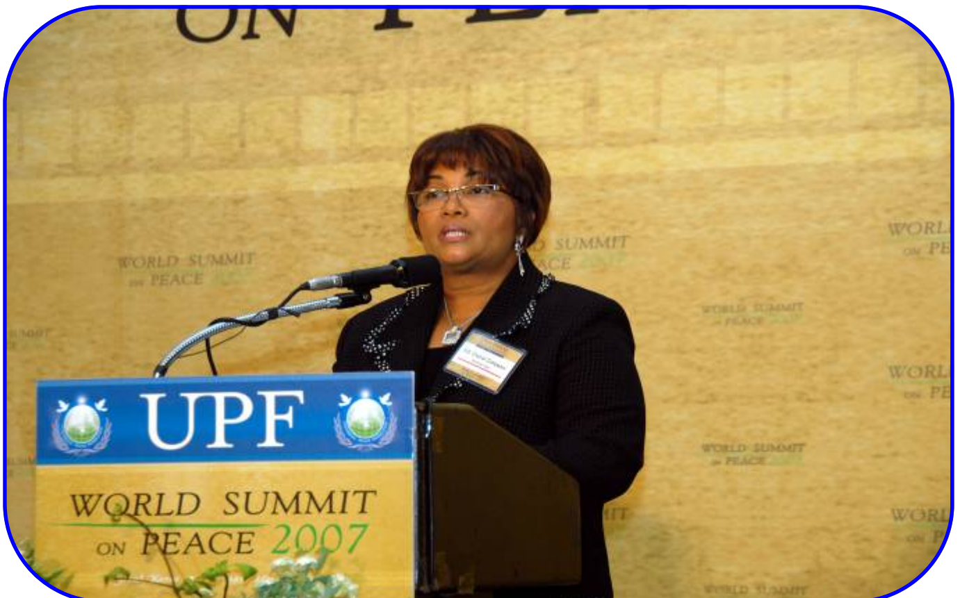
Greetings from the First Lady of Burkina Faso, HE Chantal Compaore Terrasson