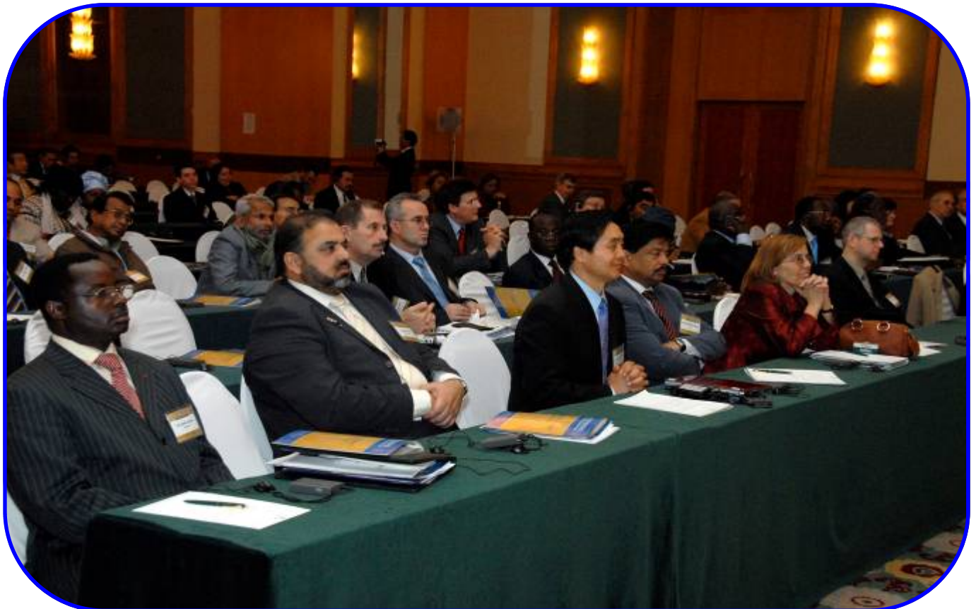
Attentive plenary delegates