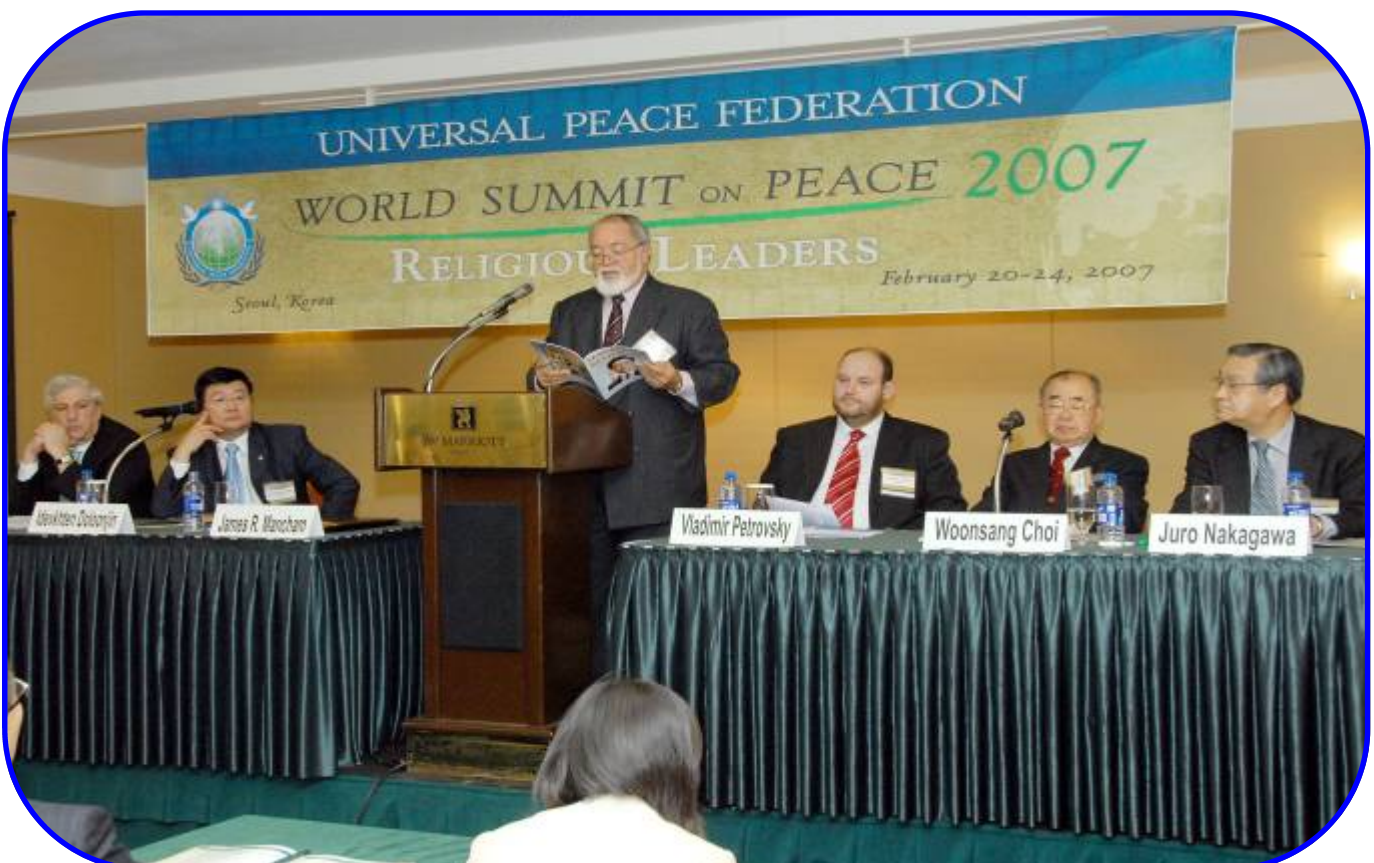
Sir James Mancham addresses North East Asia Panel