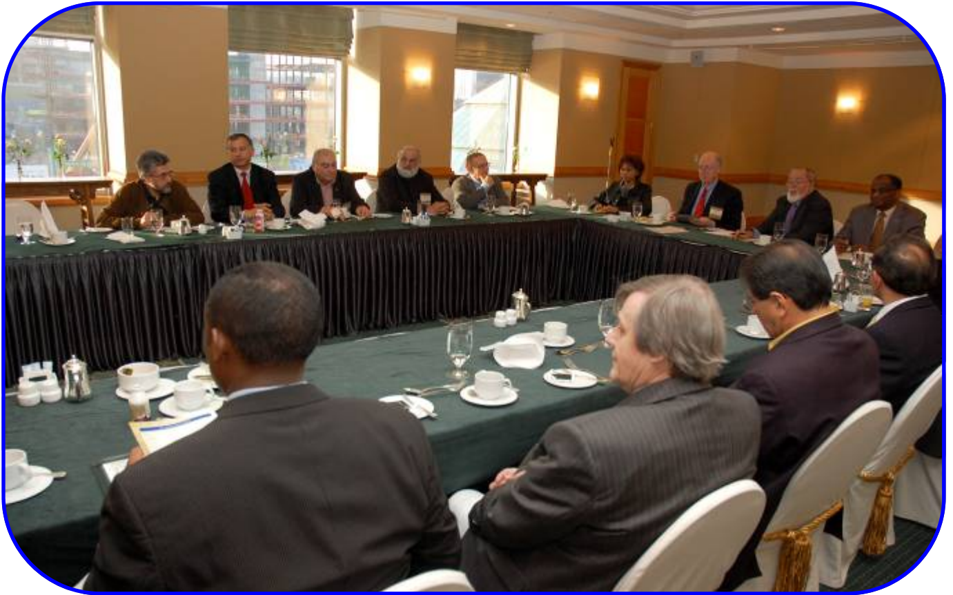
The Global Peace Council in session