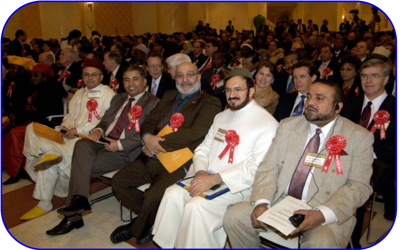
UPF Delegates and the Peace Palace