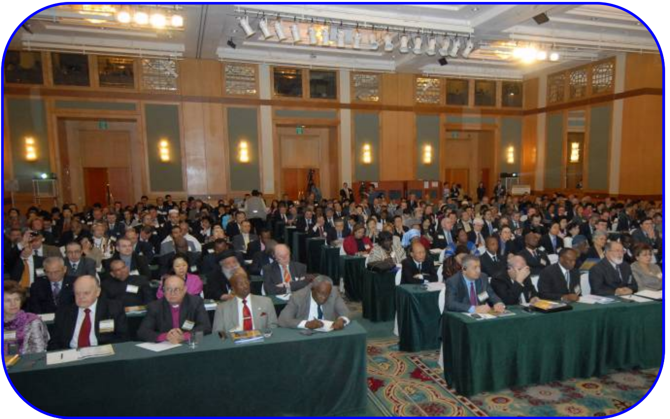
The Opening Plenary : Peacebuilding and Human Development: Prospects and Challenges