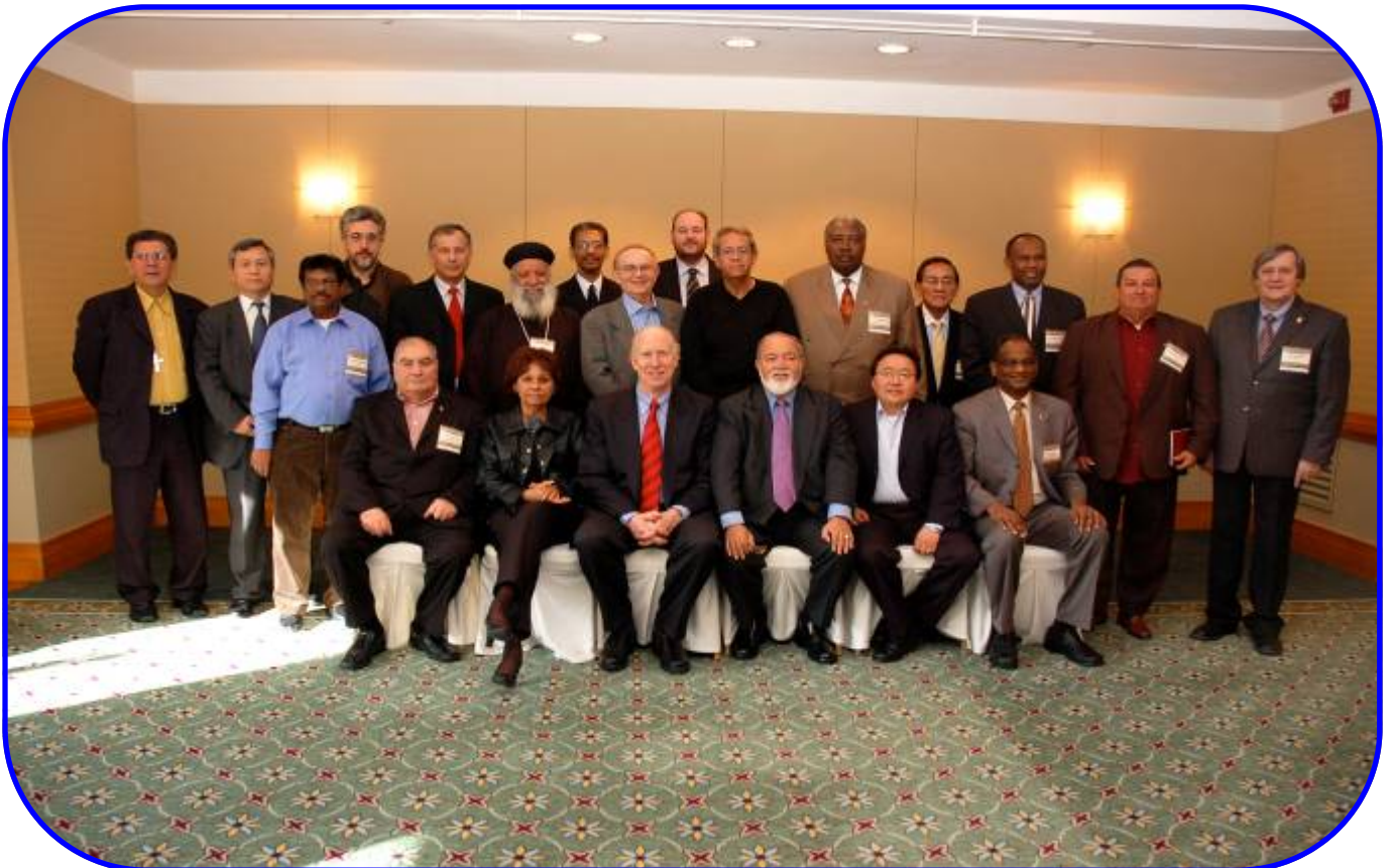
Some of the Global Peace Council members of The Universal Peace Federation