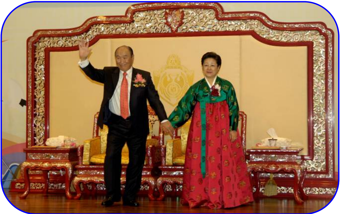
True Parents greet the delegates