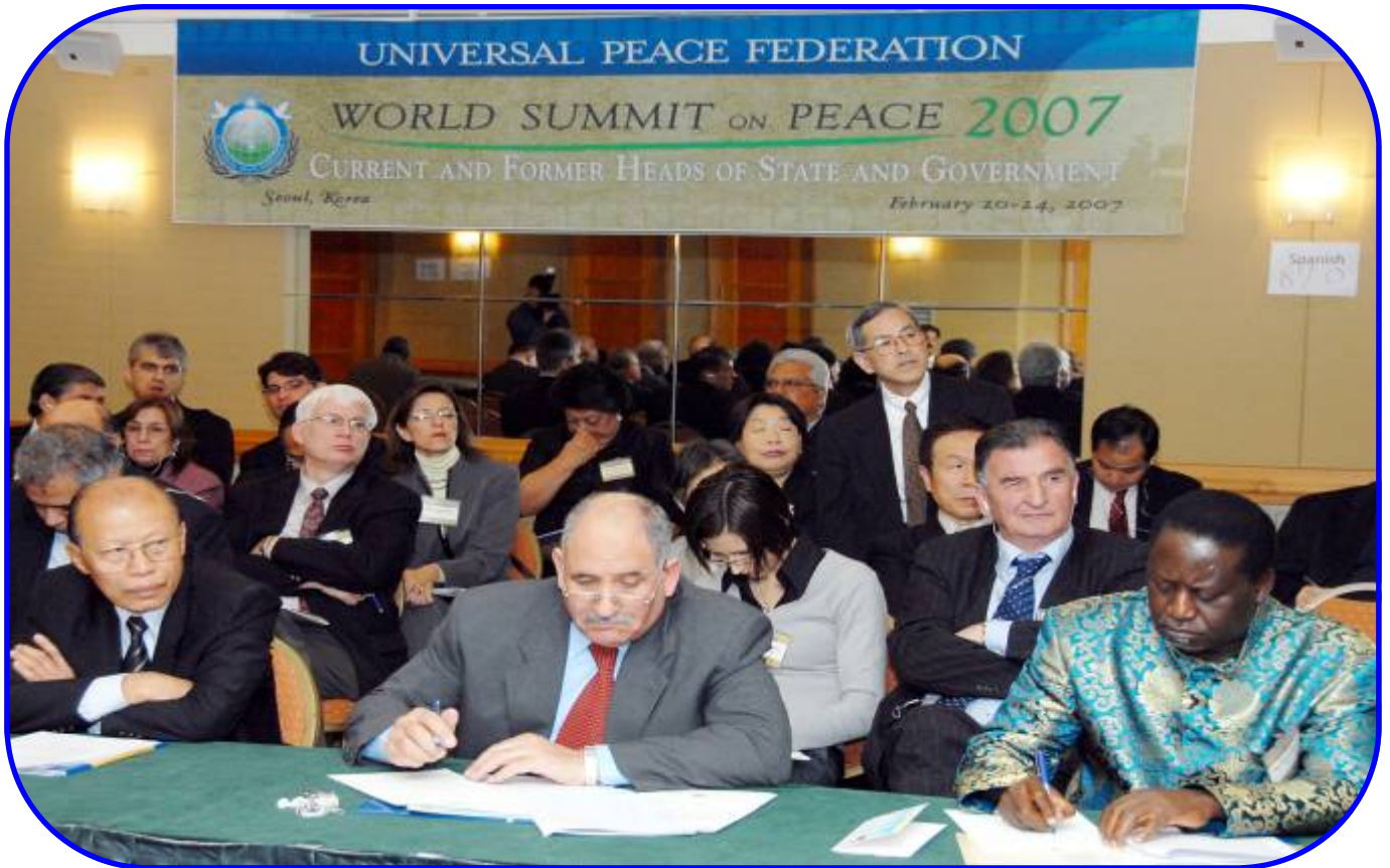
Current and former Heads of State and Government discuss the progress of the UN Interreligious Council project