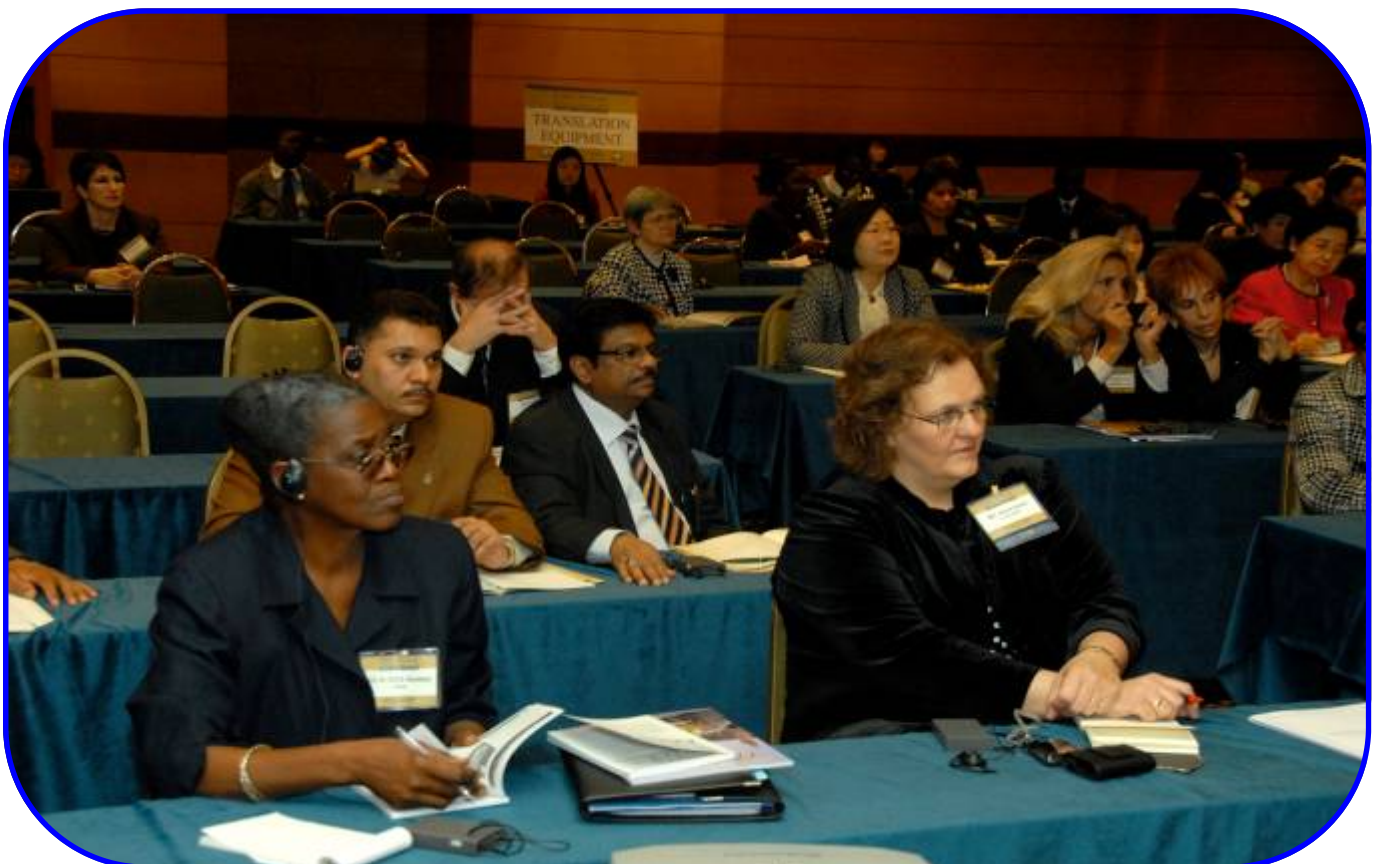
A number of parliamentarians came to observe the WFP sessions.