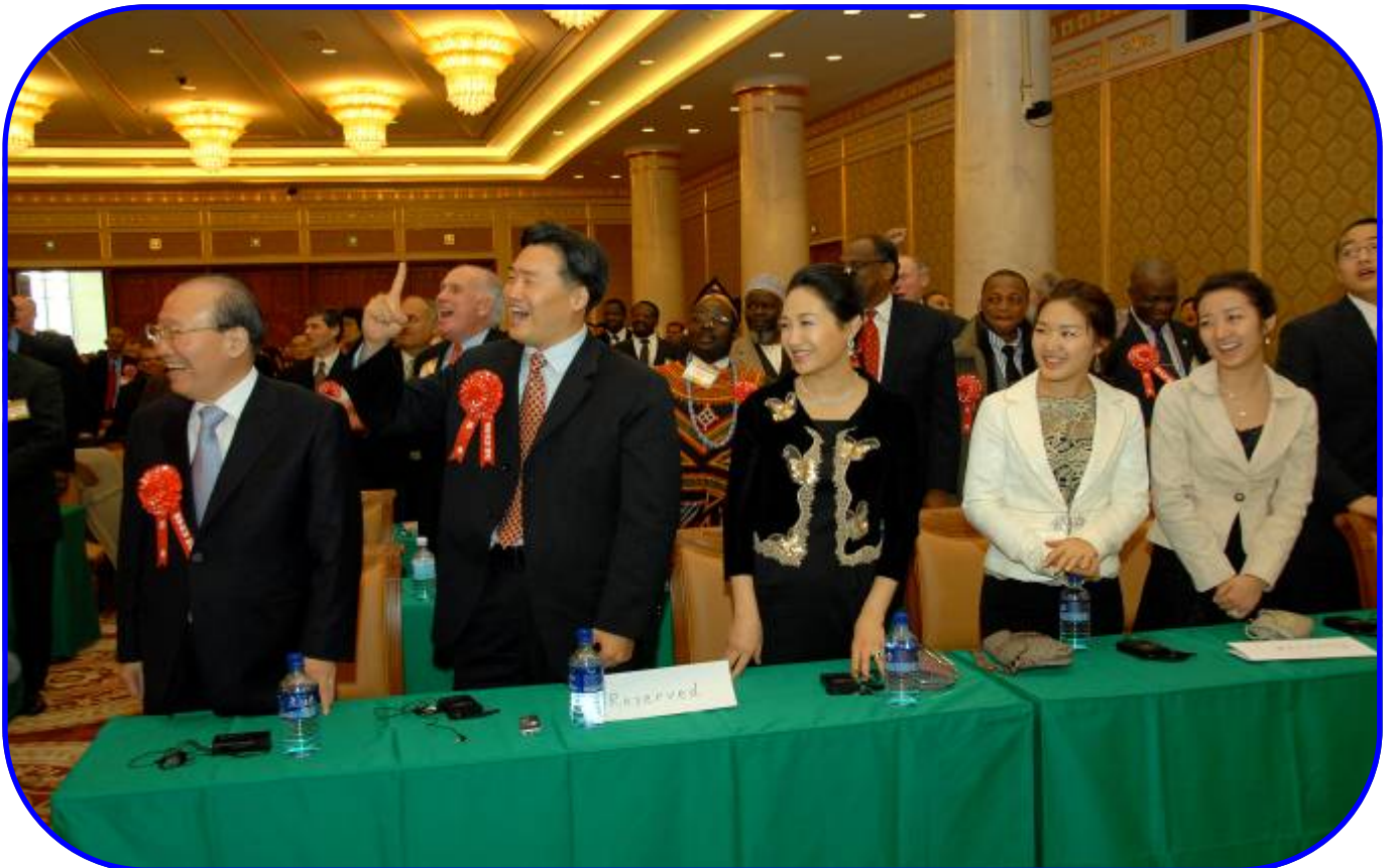
The whole conference joins together calling for "One Family Under God, Aju!"