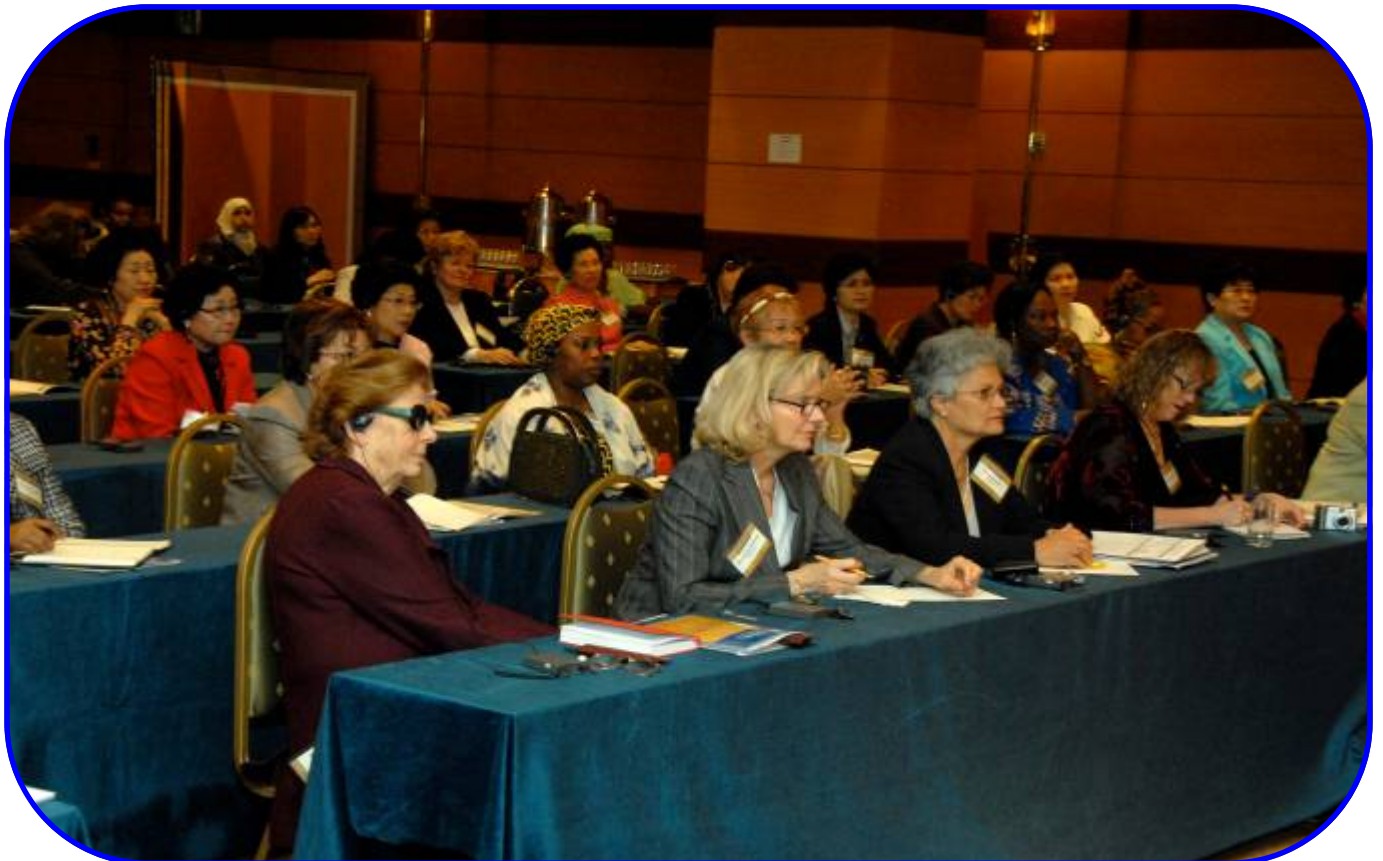
Women for Peace is a new initiative of UPF launched in partnership with the Women's Federation for World Peace