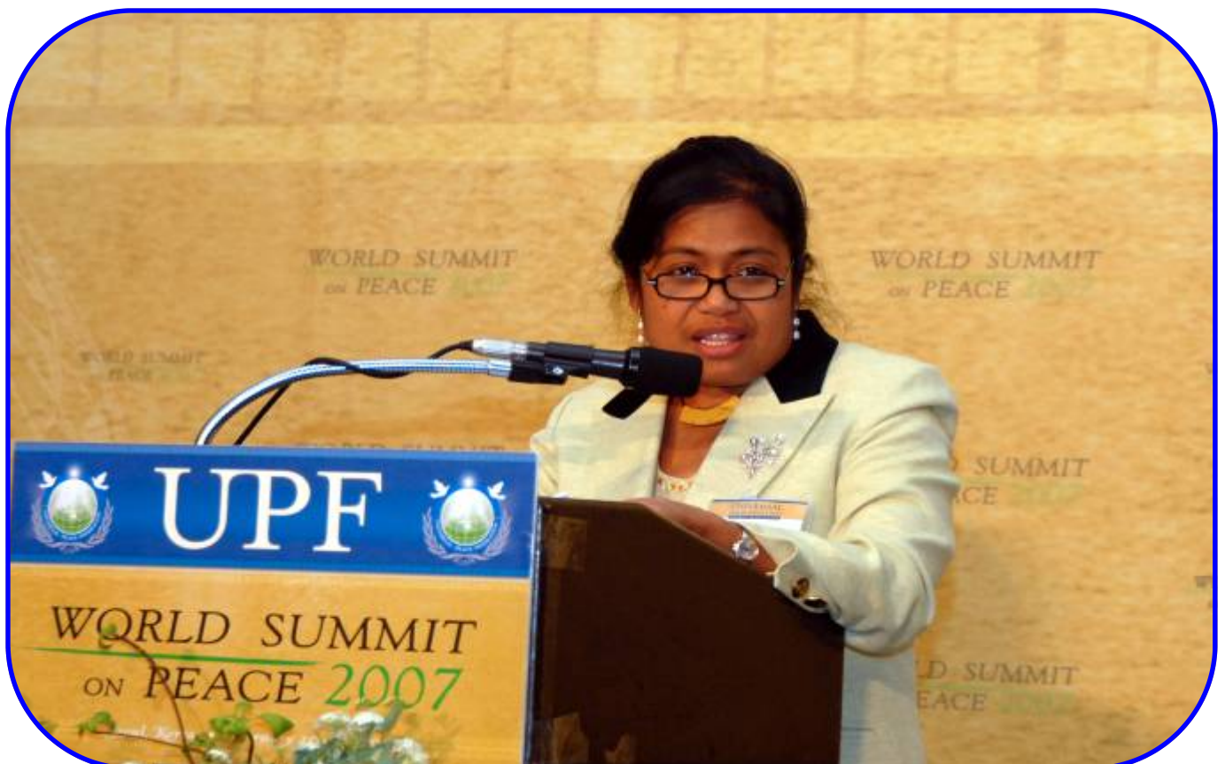
Welcoming remarks from Debbie Remengesau, first lady of Palau. The conference includes special sessions for women leaders and for first ladies.