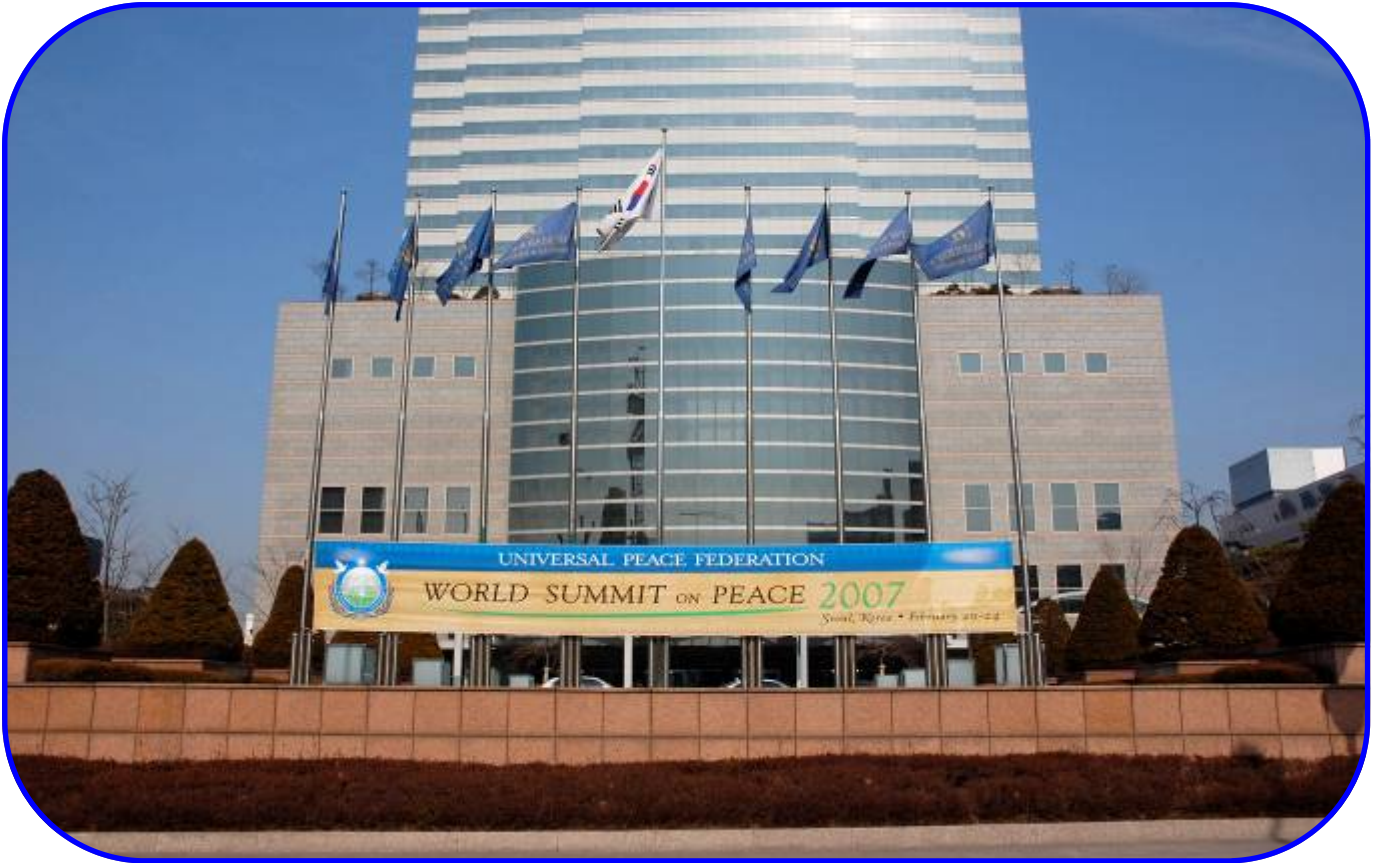
The JW Marriott Hotel, location of the Universal Peace Federation's World Summit on Peace 2007. More than 350 were in attendance.