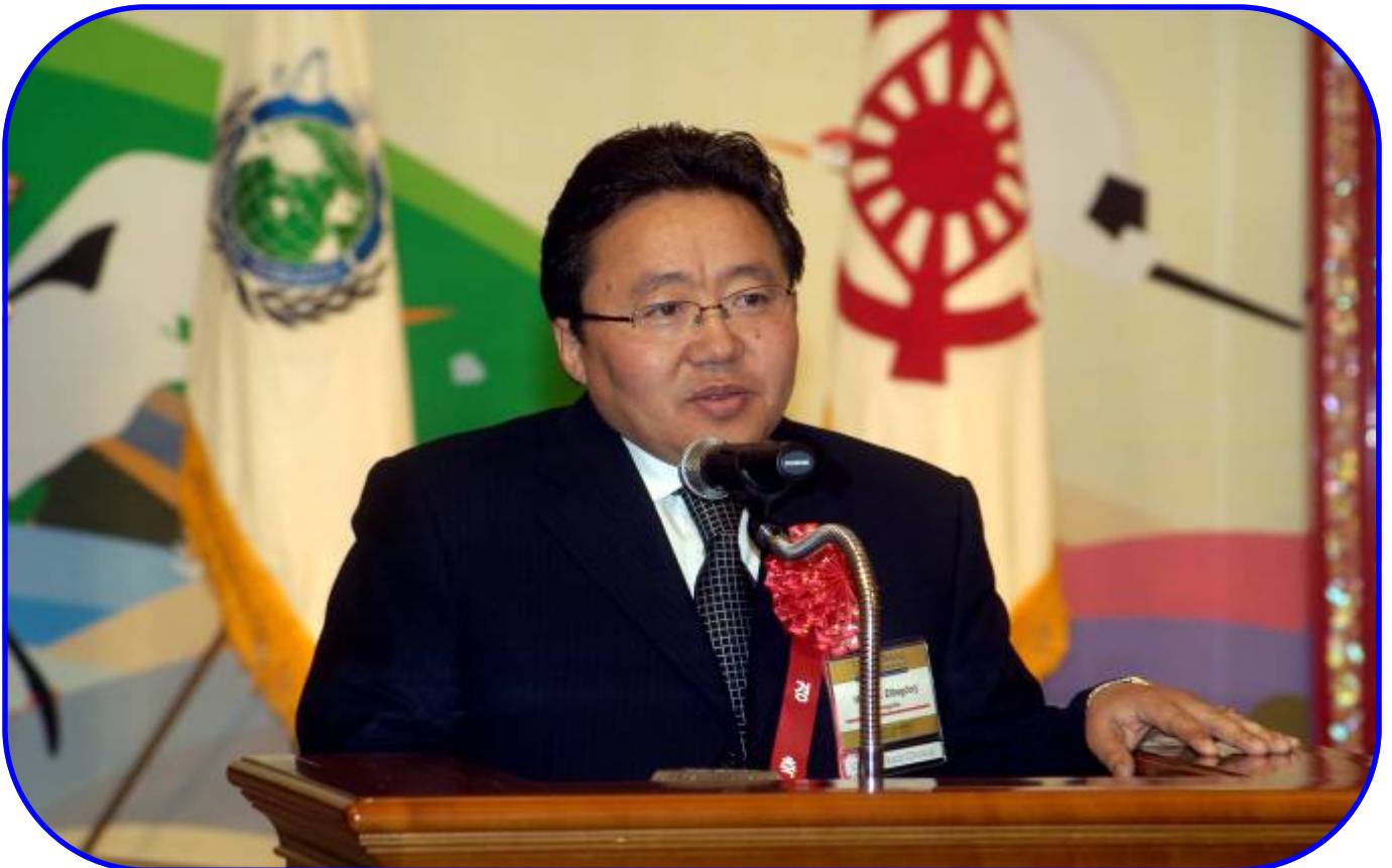
Former Mongolian Prime Minister HE Tsakhia Elbegdorj, known as the 'Thomas Jefferson of Mongolia' offers congratulatory remarks.