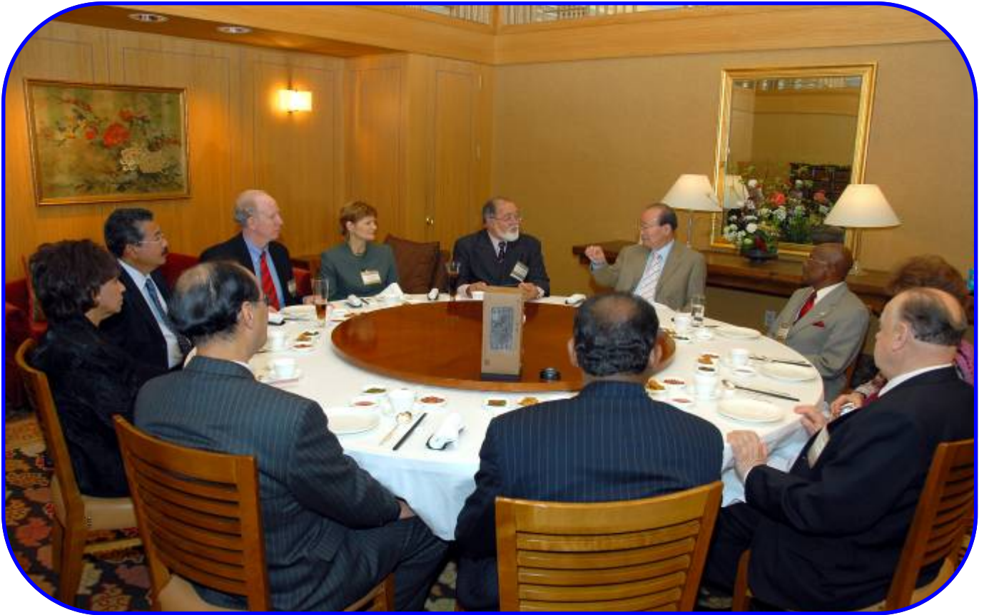
Meeting of the UPF Presiding Council