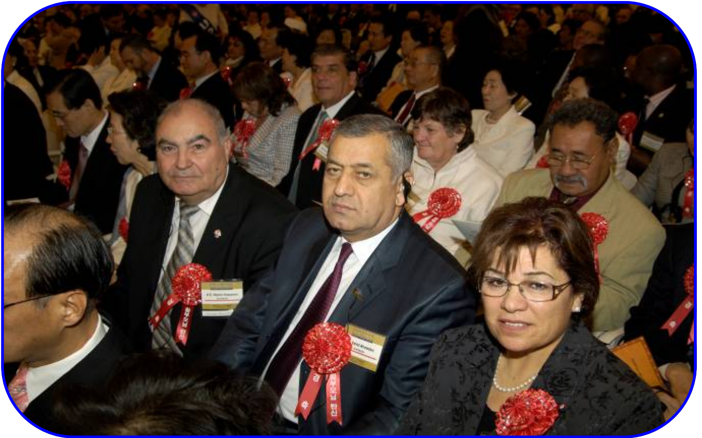
UPF Delegates at the Peace Palace for the Birthday and Mi-soo Celebrations