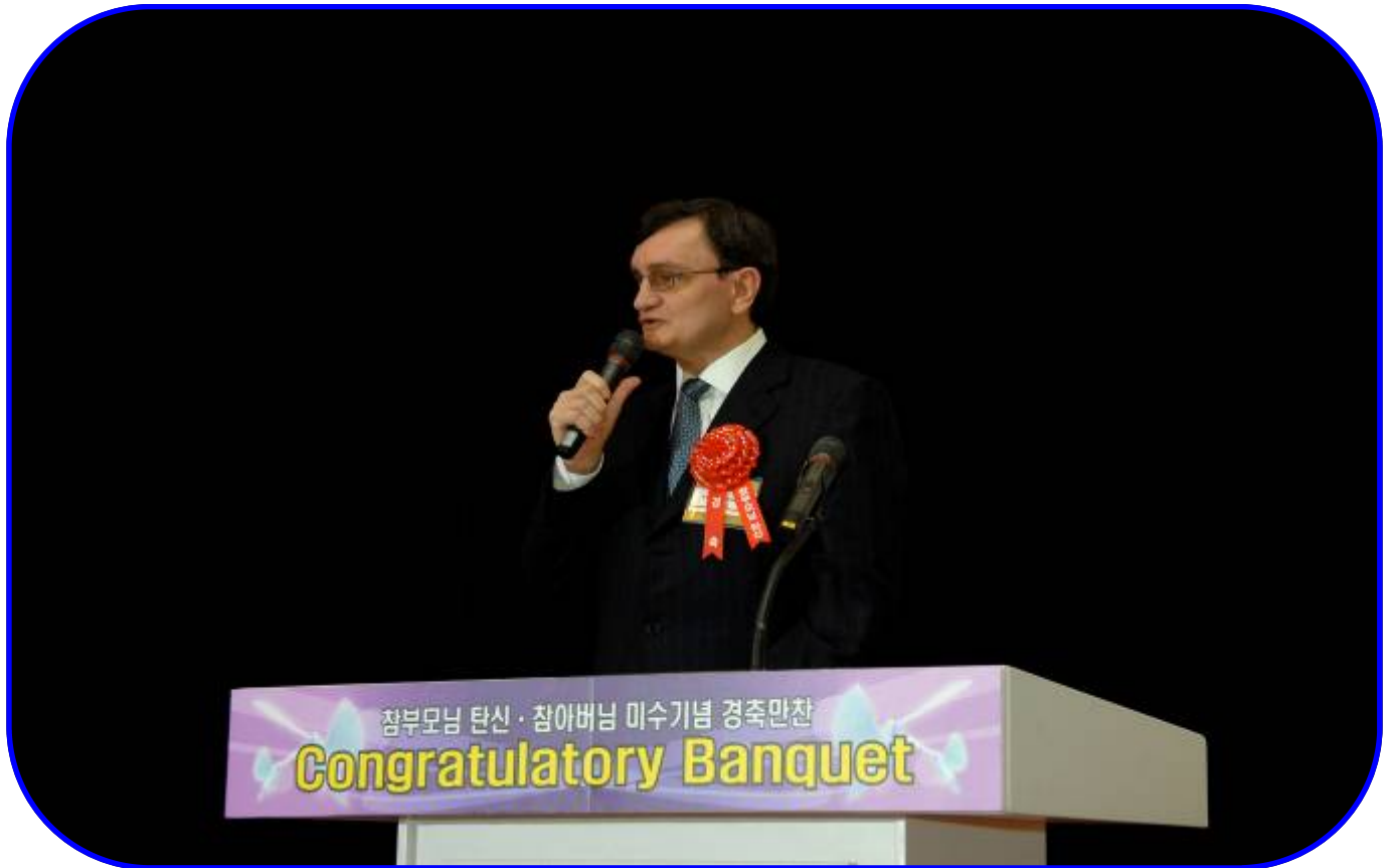
Former Romanian President Victor Ciorbea offers greetings at the banquet