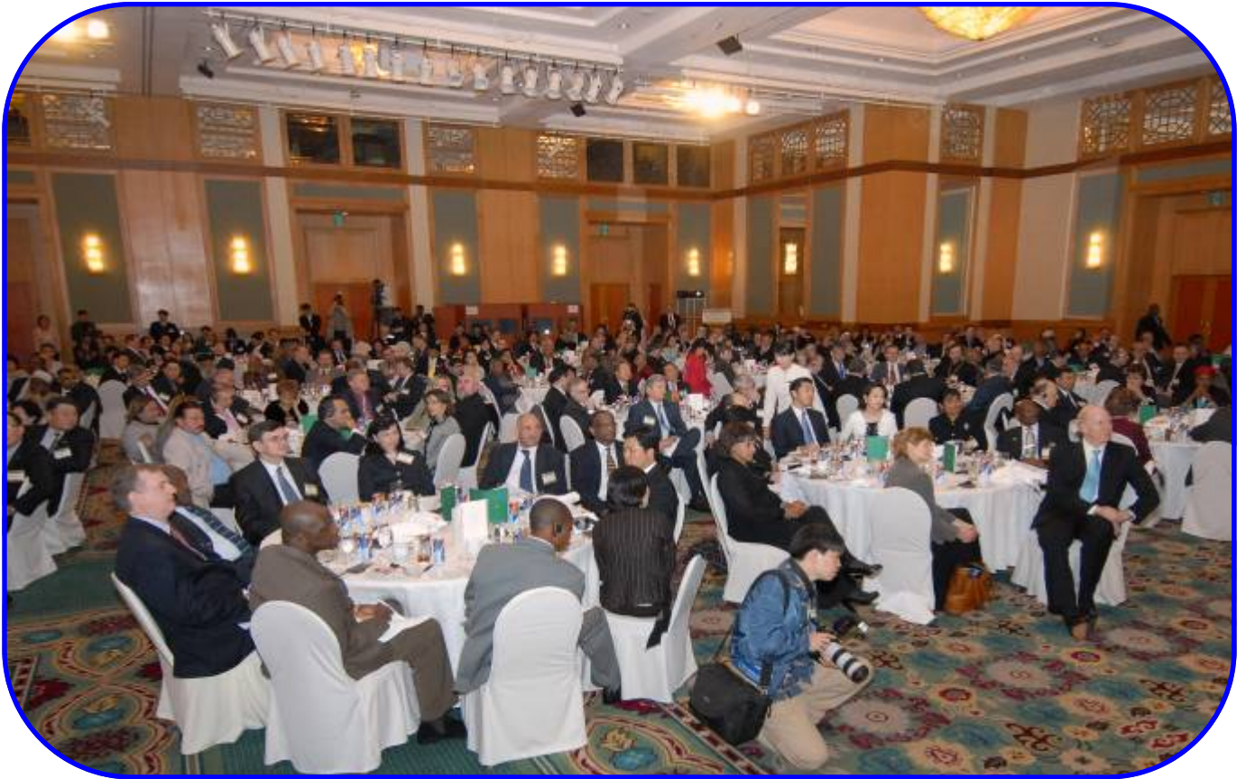
The Opening Banquet