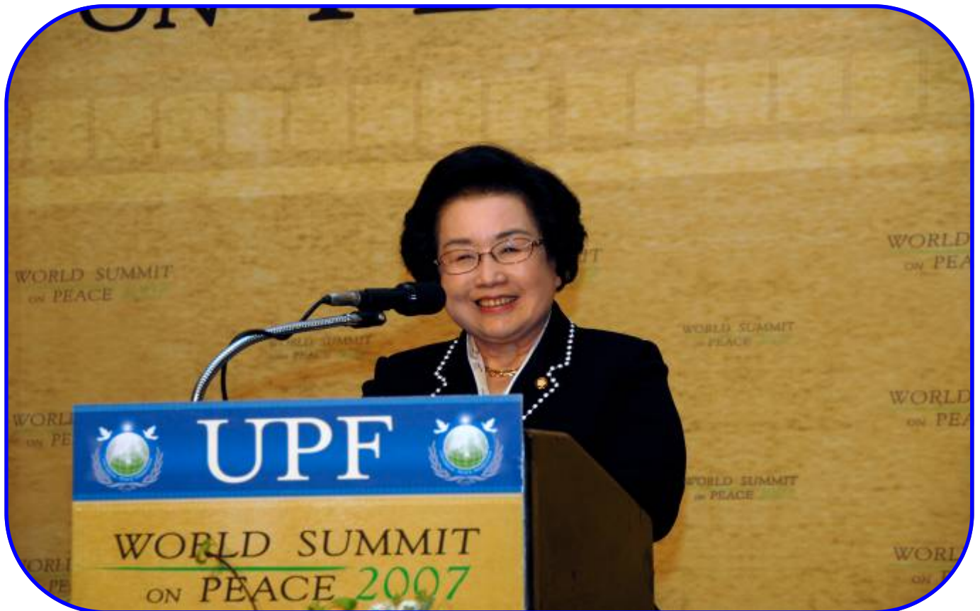
The Hon. Hee Moon, member of the Korean National Assembly, welcomes UPF and the International Delegates to Seoul