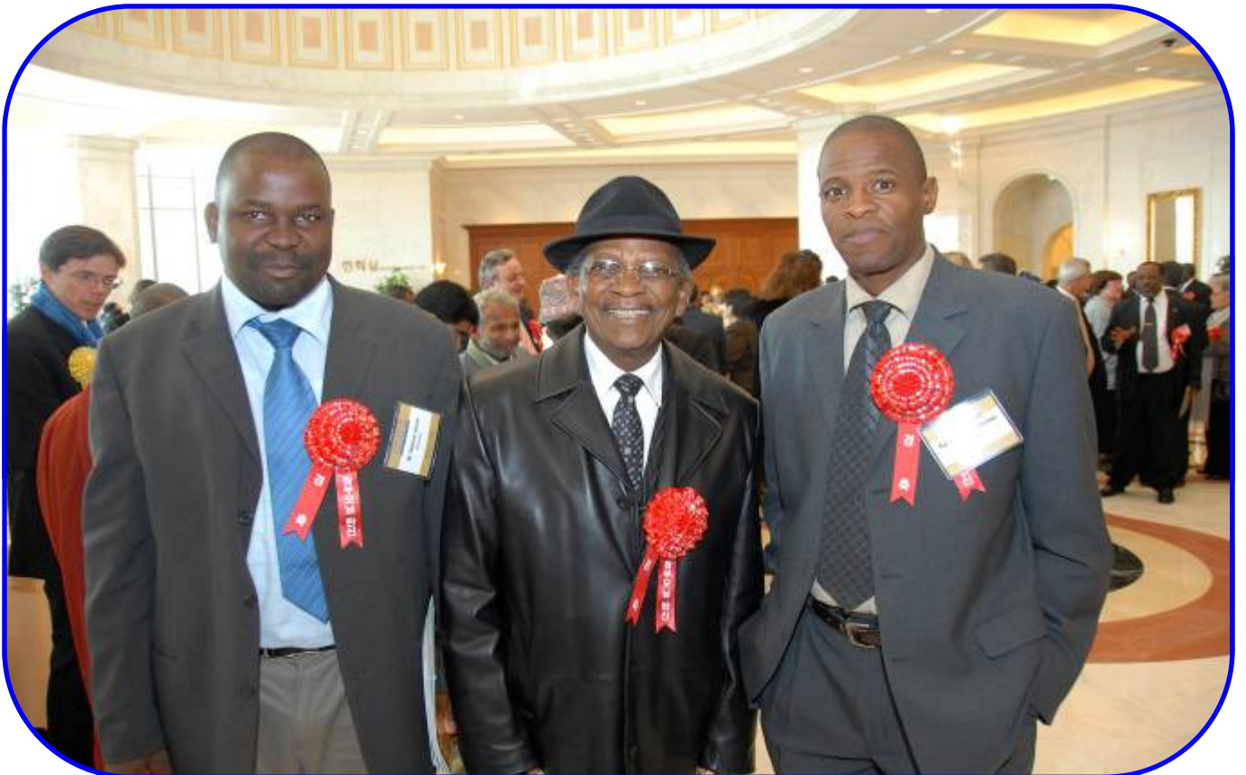
Parliamentarians from three African nations in the Palace Lobby