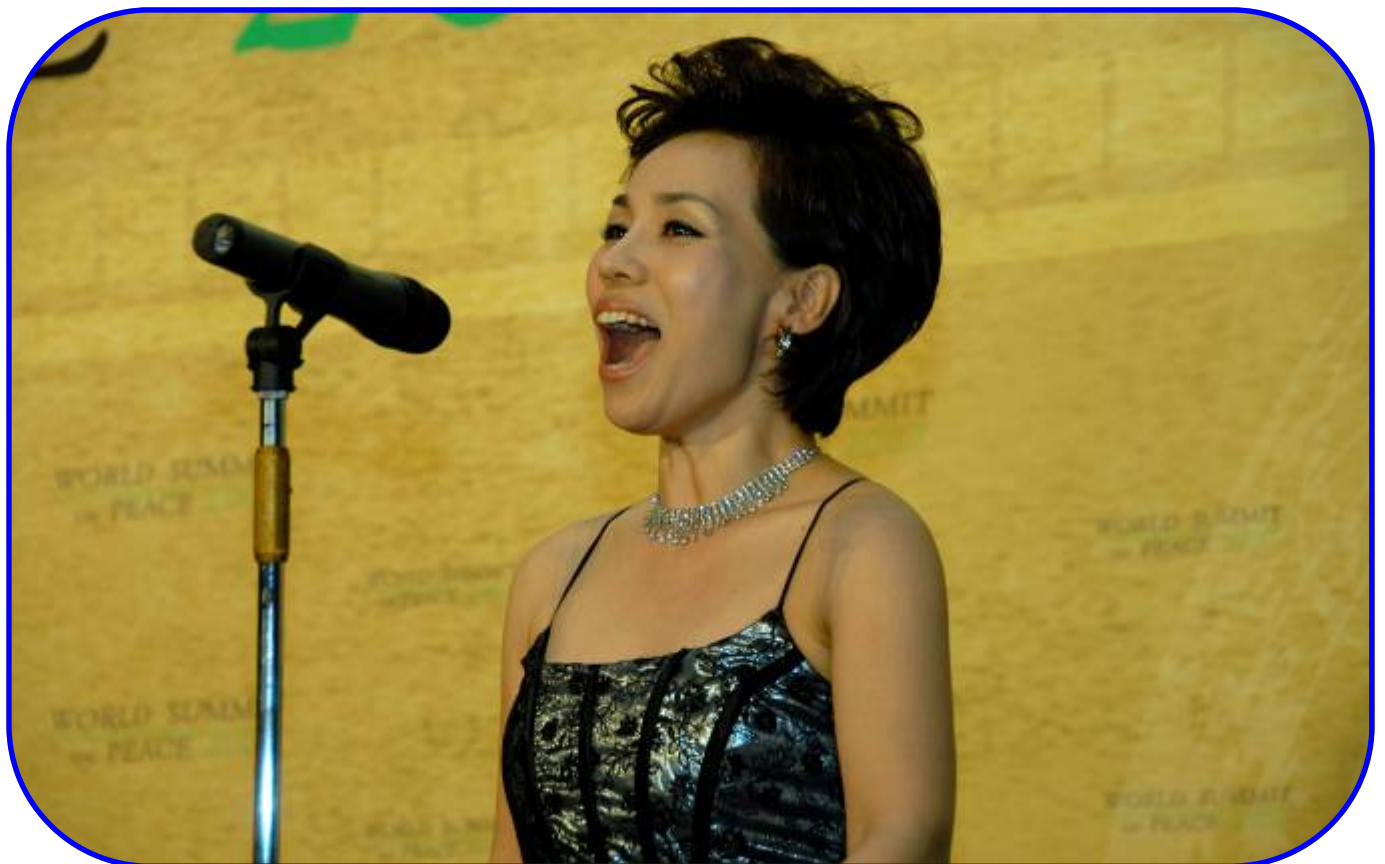
A congratulatory song