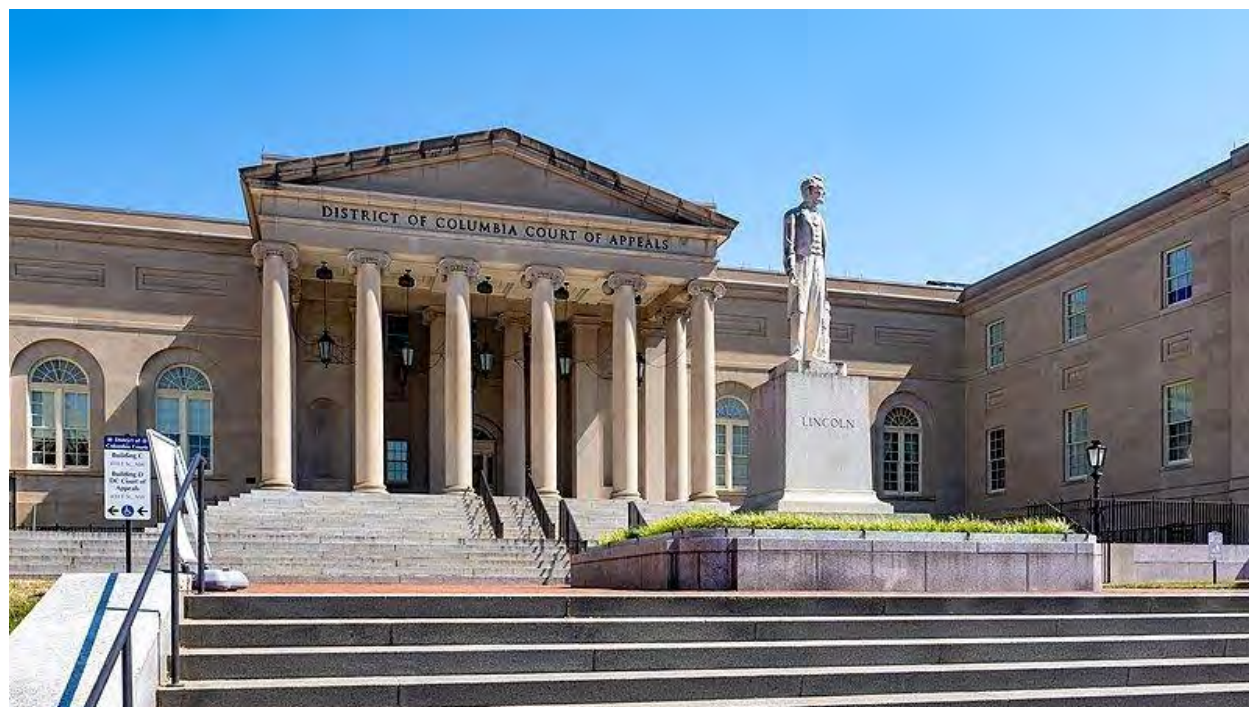
District of Columbia Court of Appeals