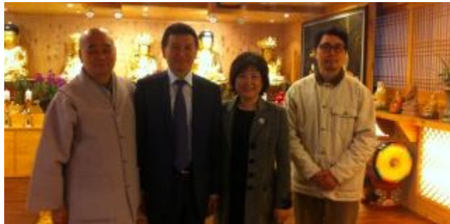
A Step Closer to the Olympic Movement