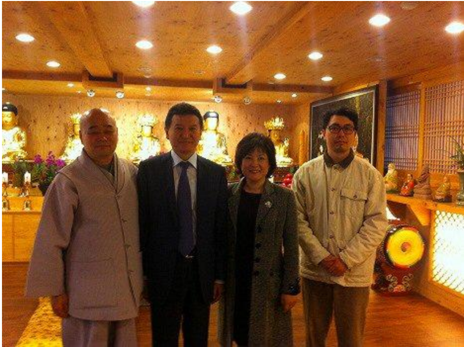
Ilyumzhinov visiting the Buddhist temple