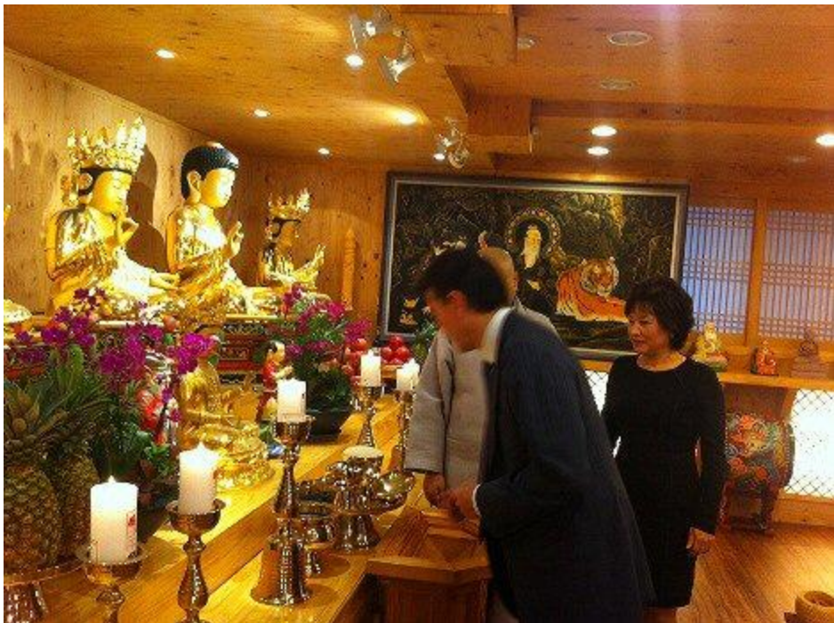
In the Buddhist Wol Myung Temple