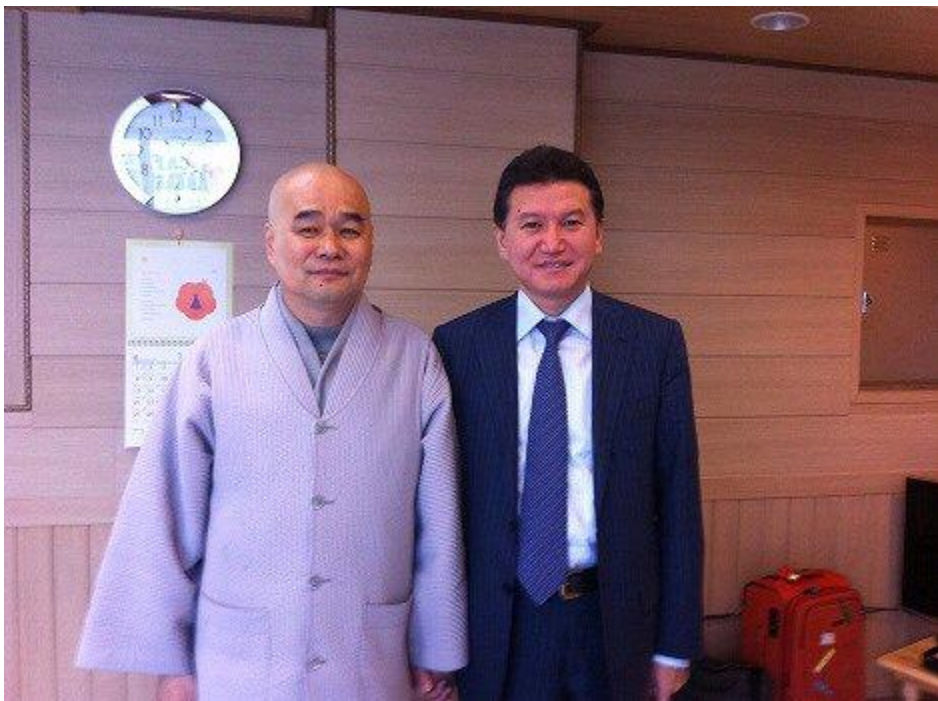
Kirsan Ilyumzhinov and Hon. Venerable Wol Myung