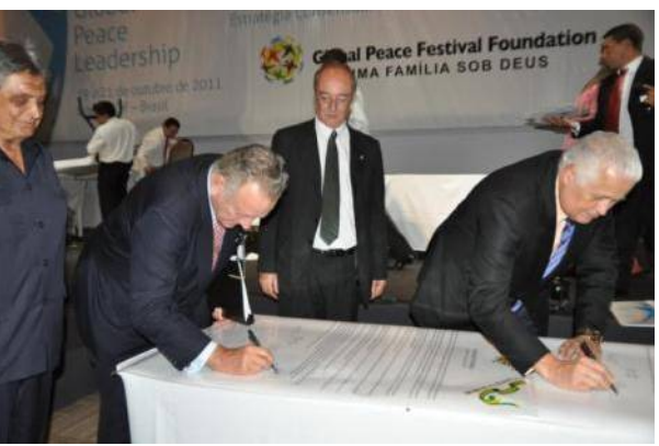
Former presidents signing Declaration