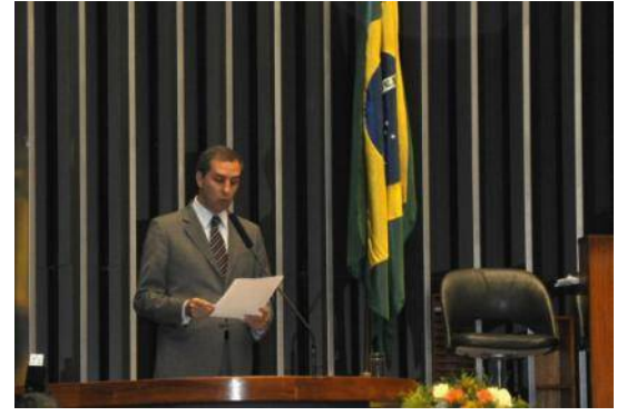
Goias state Vice Governor Figuereido Jr.