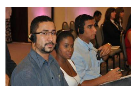
Students from the Catholic University engaging in discussion sessions (above) and other participants attending the event (below)