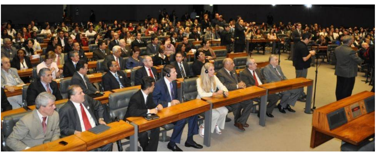
Brazilian parliamentarians and int'l participants at the Congress (above), Speakers (below)

A solemn session honoring the work and achievements of GPFF took place at the Chamber of Congress in Brasilia, Brazil on October 21, 2011. The ceremony took place amidst the participation of national senators and congressmen, international GPLC participants and 5 former presidents (Panama, Ecuador, Guatemala, Uruguay, and Paraguay).