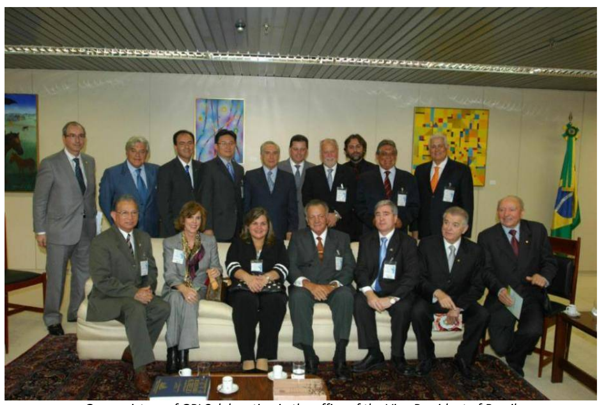
Group picture of GPLC delegation in the office of the Vice-President of Brazil