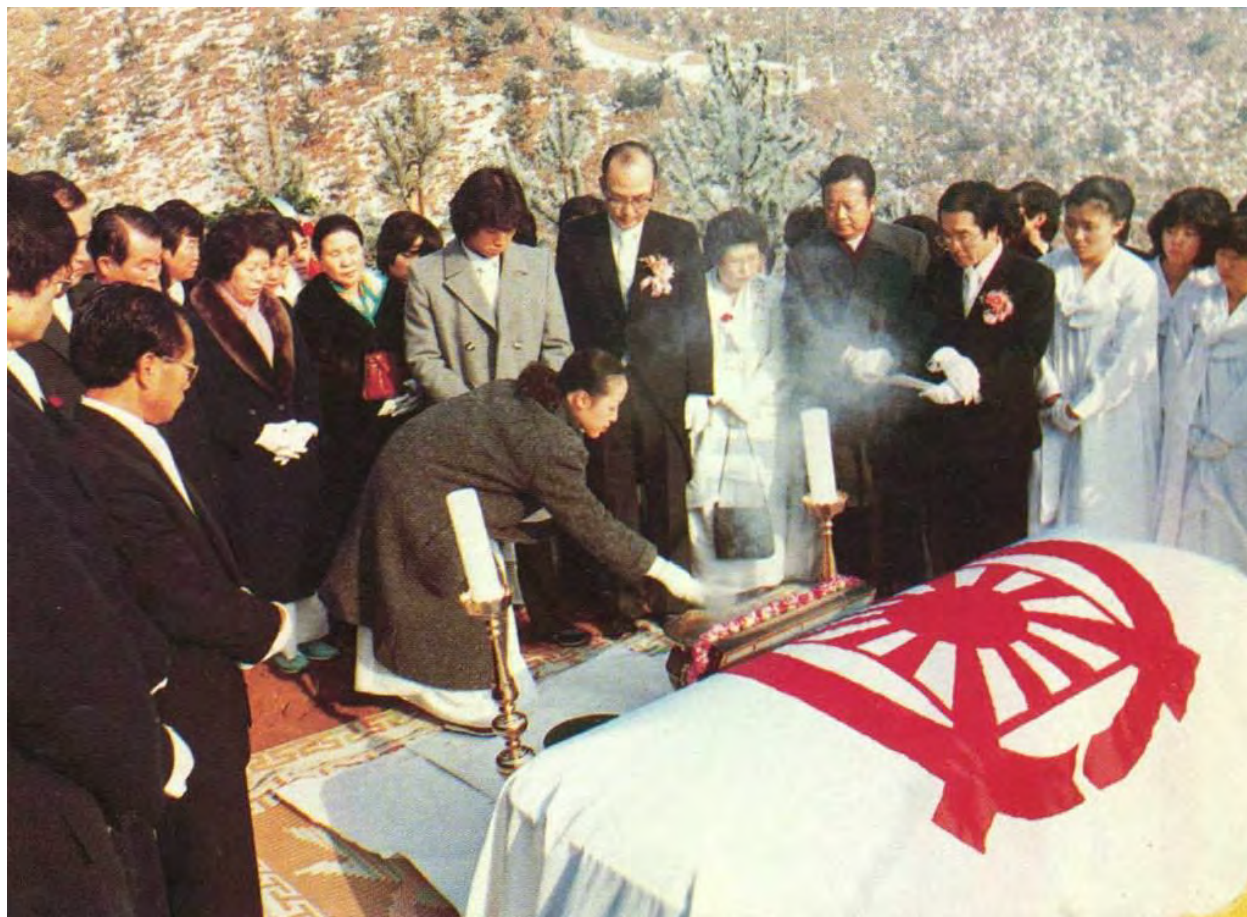
Won Jeun Ceremony at Pa Joo in the mountains North of Seoul