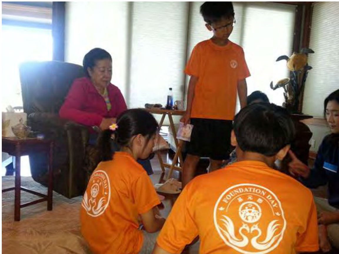
True Grandchildren Divine Principle Workshop