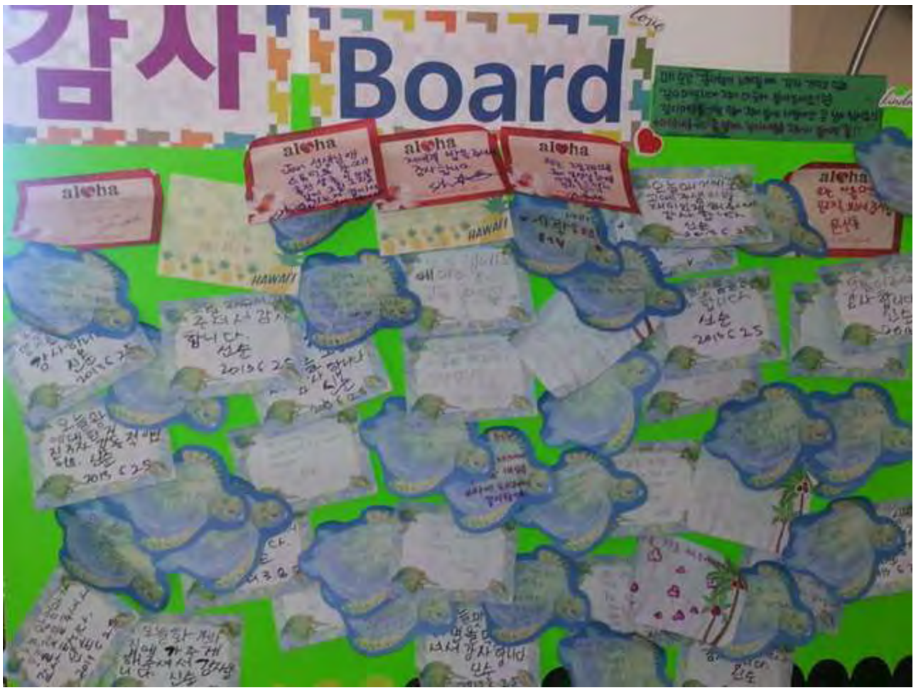
True Grandchildren Divine Principle Workshop - Thank Message Board