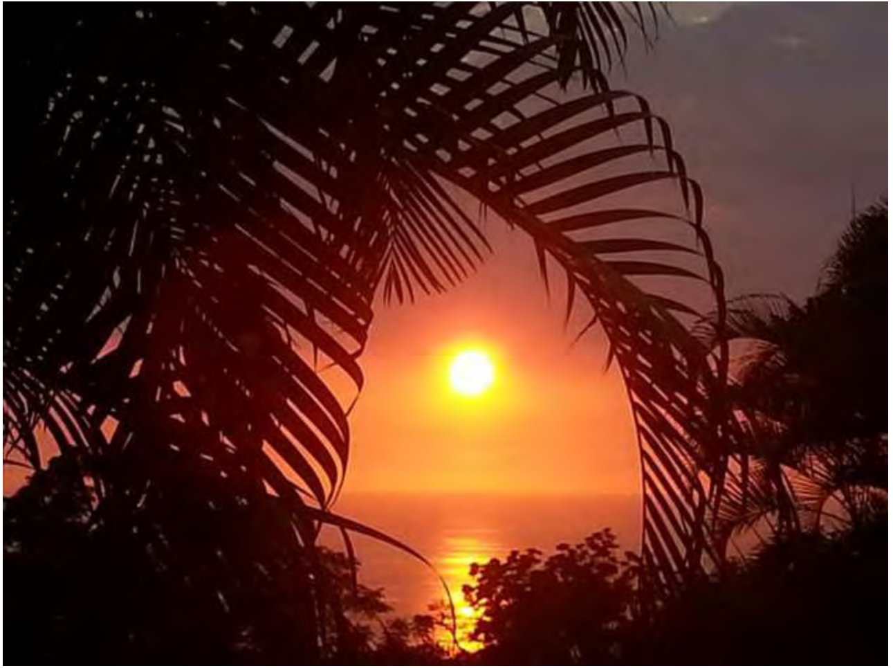
Sunset of Kona, Hawaii