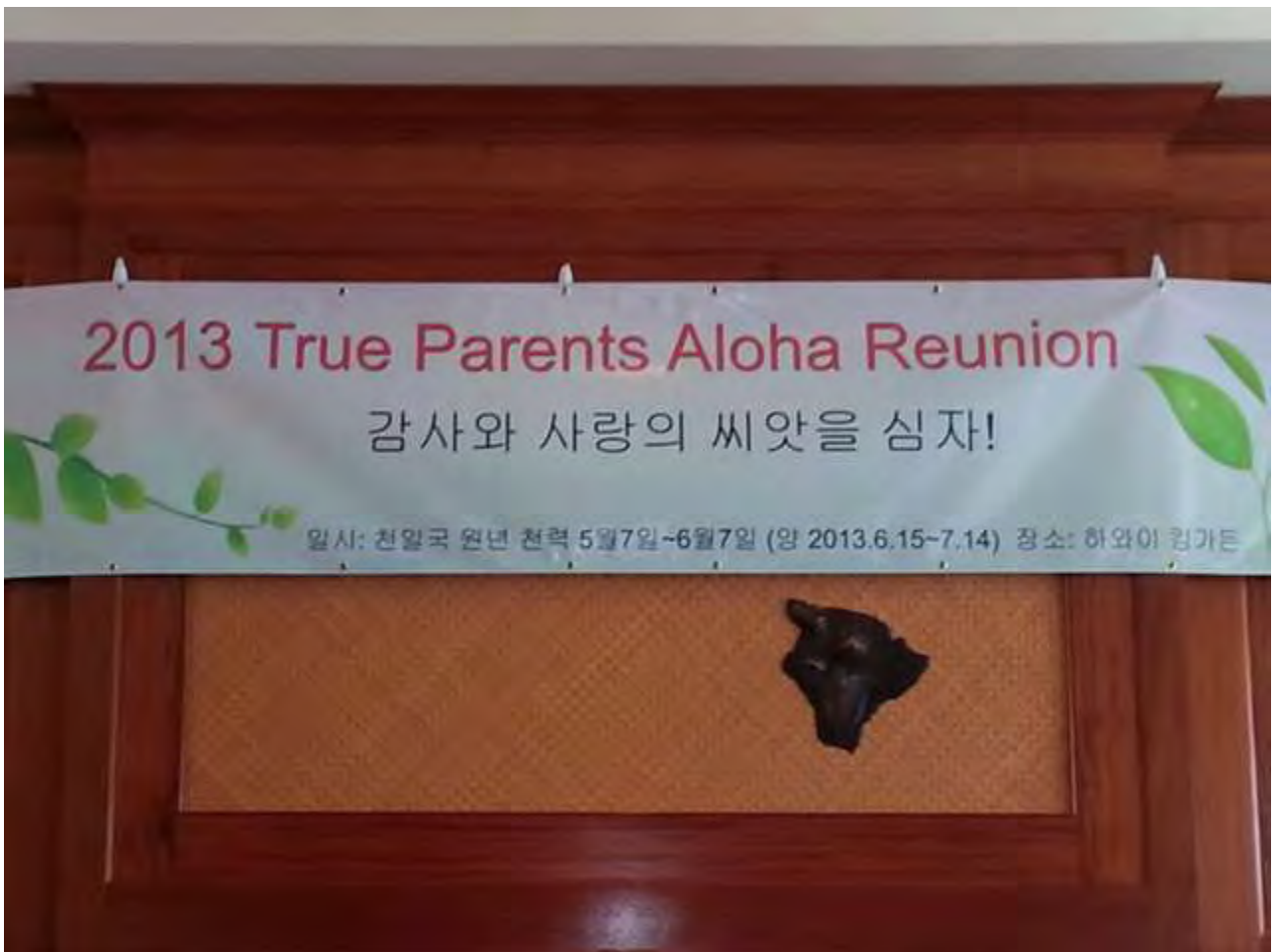
True Grandchildren Divine Principle Workshop - Title: Let us plant seeds of Love and appreciation!