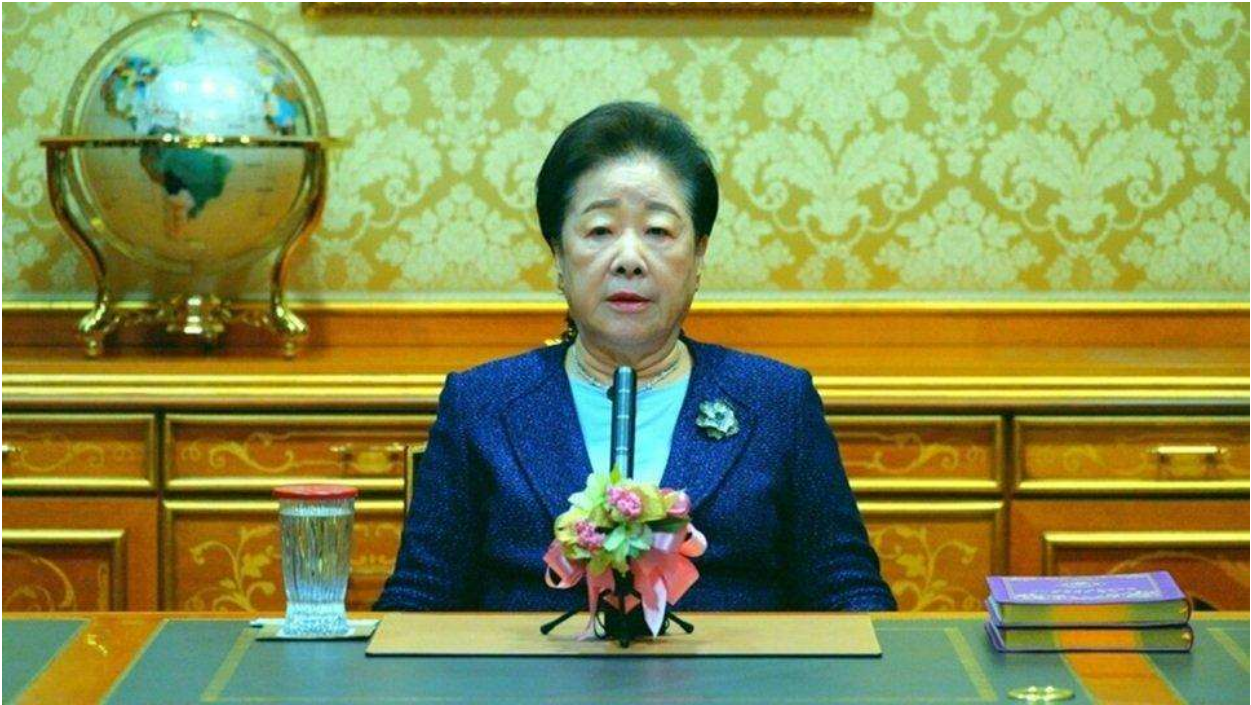
Hak Ja Han , Holy Mother Han, speaking on August 31, 2025