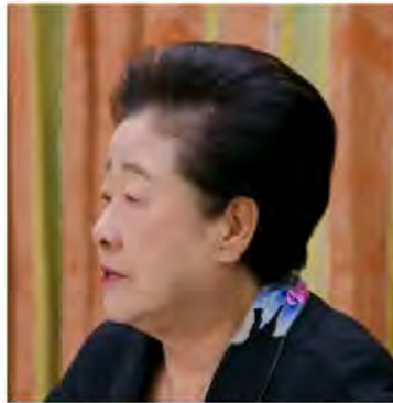
Hak Ja Han, Holy Mother Han, at a meeting in Gapsyeong, South Korea.

Our True Mother has said that this course is like labor pains before the birth of a precious child. After heavy rains, the ground becomes firmer; the purest steel is forged in the hottest fire. I believe this present crisis is a providential opportunity for us to stand anew before Heaven, transparent and pure, without a single blemish.