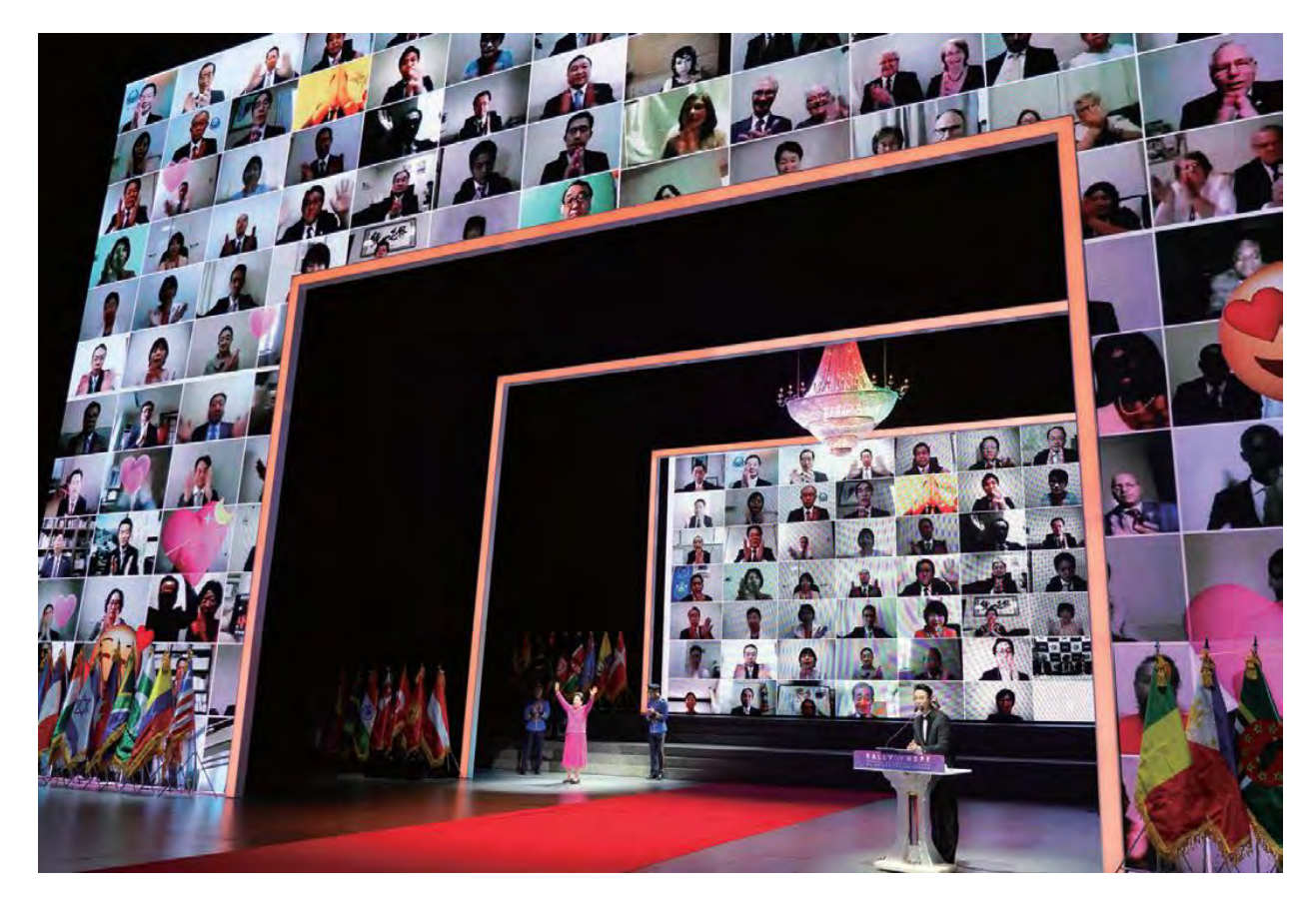
A time to heed Heaven's warning

Unpredictable natural disasters are arising all over the world and the coronavirus pandemic is still worsening. We are all worried that it will not come to an end this year.