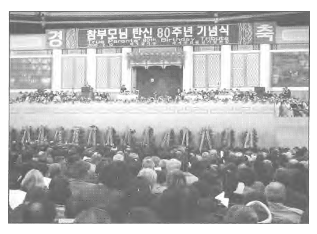
The main stage at the Olympic Gymnastic Stadium, Seoul, Korea, February 10, 2000.