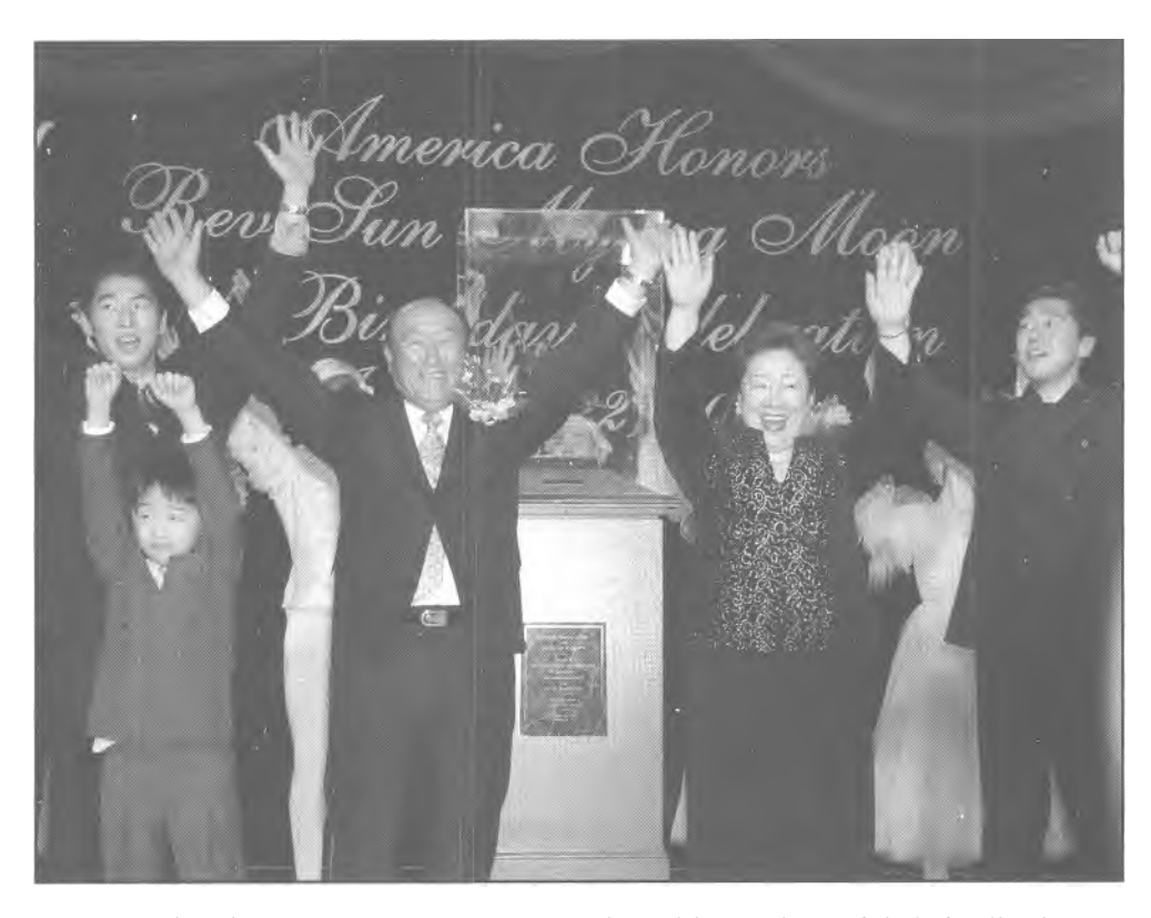
Reverend and Mrs. Sun Myung Moon together with members of their family cheer at the conclusion of the celebration.

sessing superior political, military and economic power have controlled the world. However, no nation can exist eternally unless it is in line with God's providence. The fall of the once glorious Greek and Roman civilizations are good examples of this.