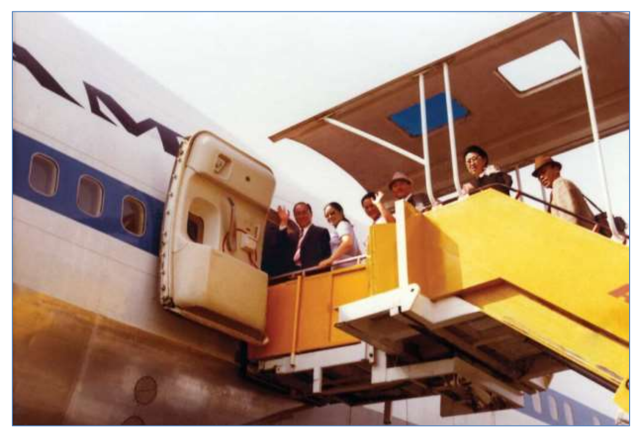
True Parents and entourage boarding the plane at Delhi, India, enroute to Bangkok, Thailand, April 17, 1972

In the past there have never been any counterproposals to communism, but now we have one. In Japan and Korea the communists can't touch us, they can't touch our truth because our counterproposal is too strong. There is a very strong North Korean communist clique in Japan and the North Koreans there had already received information that I was coming to Japan on my way here. It was therefore necessary to have police and local officials protect my family and me. The police received threatening telephone calls. The Japanese church did their best to protect me even though I was in Japan for a week, but I could not have a large meeting with all the members there.