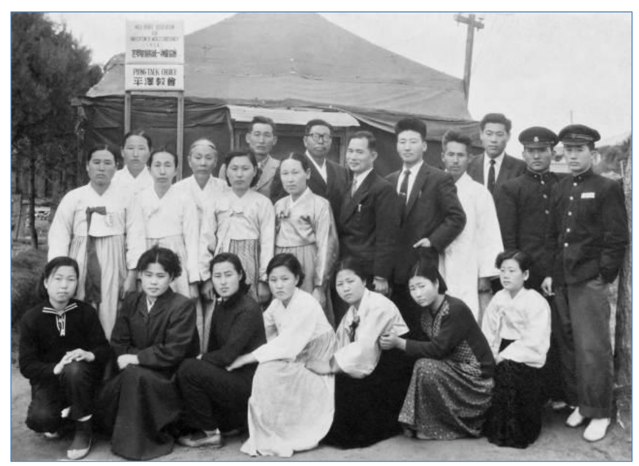
Members in Pyongtaek take a photograph with an itinerant Unificationist evangelist who is visiting their community during a campaign to double church membership.