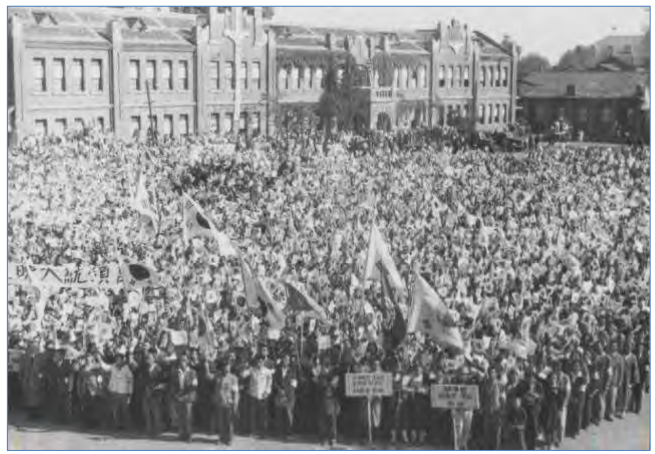
Pyongyang citizens gathered to welcome the UN forces' retake of Pyongyang on October 19, 1950