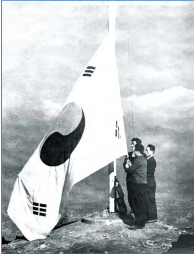
The Korean flag is raised atop Namsan, a hill in the center of Seoul, celebrating Korea's newly won independence

On that day, Koreans could rise out of their desperate, hopeless situations and become a people who could meet a day of new hope; the hopes of families and individuals were renewed. If you merge the hope of a nation, the hope of families and the hope of individuals into one, it makes a foundation for national-level victory. This was the day of hope, in which we could recover the country; it paralleled Jesus' time, in which the opportunity to gain a country was lost. The day of Korean liberation in 1945 was the day of hope for recovering the lost race and the lost family.