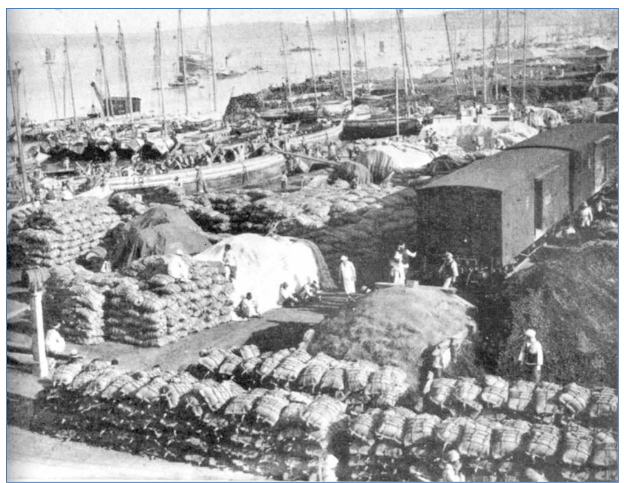
The years that Father's testimony covers were difficult ones for Korea, especially in rural areas. These photos were taken in the 1930s. Here in this picture: Rice was weighed at this inspection center at Kunsan Port, from which it was shipped to Japan.